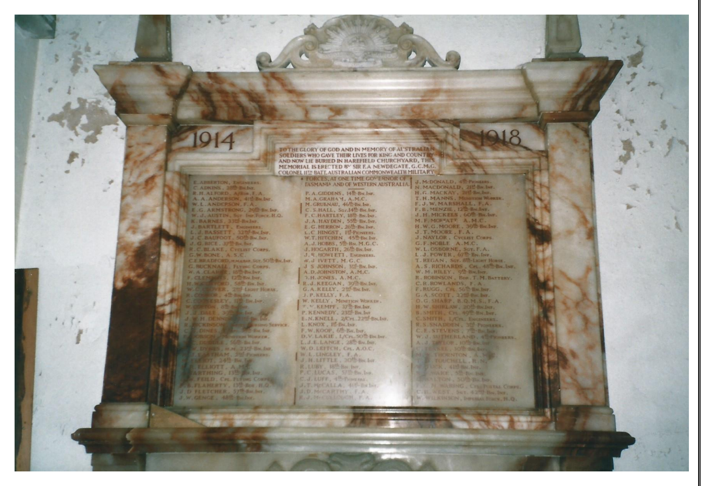
Australian Soldiers' Memorial, Harefield