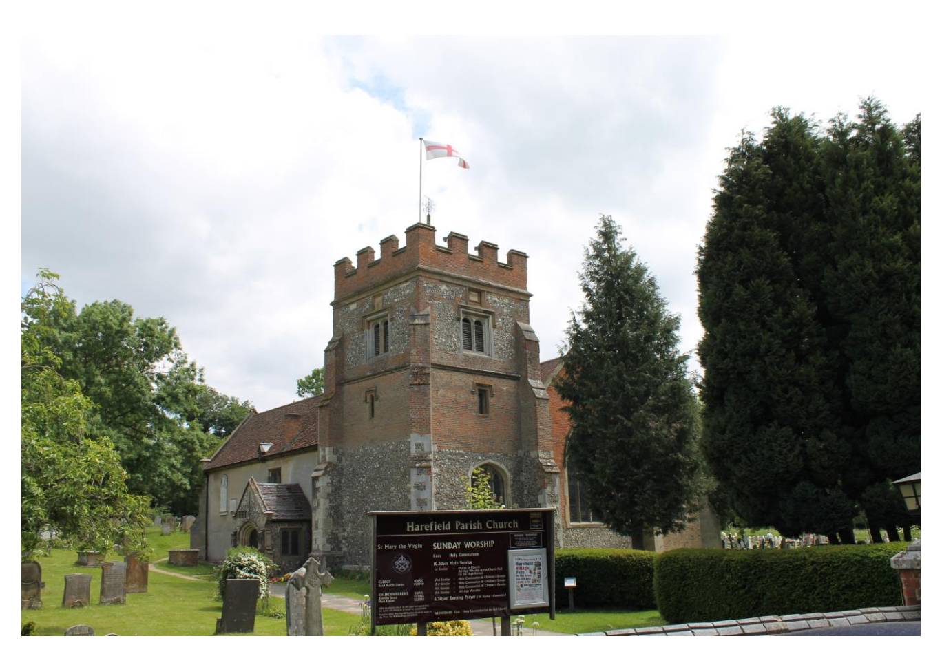
St Mary the Virgin Church, Harefield