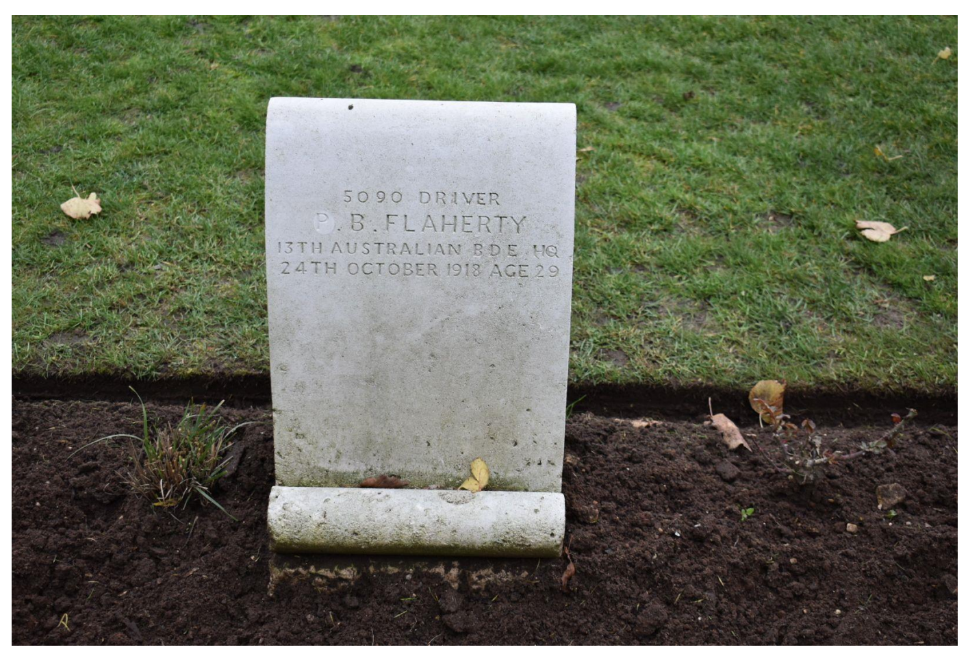
Photo showing updated Headstone with the corrected initials (the correction was apparently made in June, 2016)