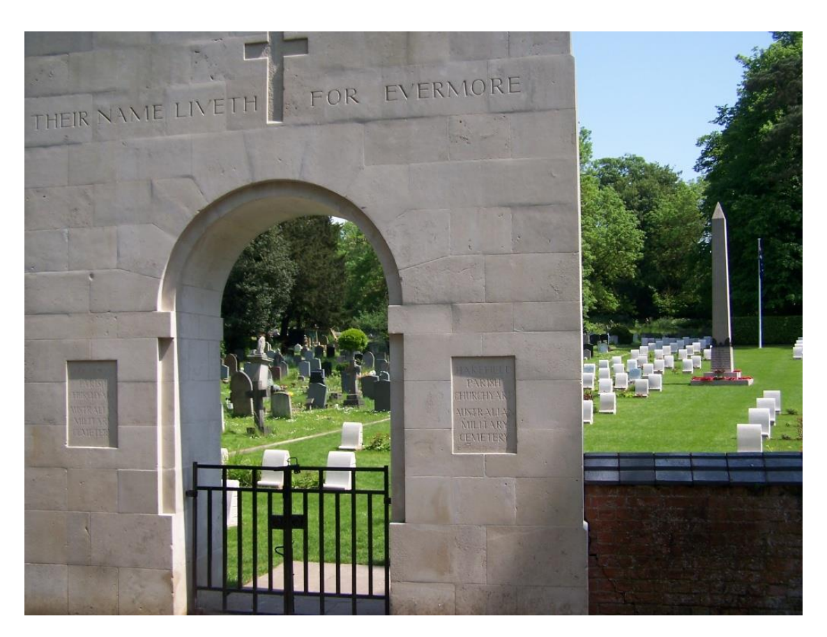
St. Mary the Virgin Churchyard, Harefield