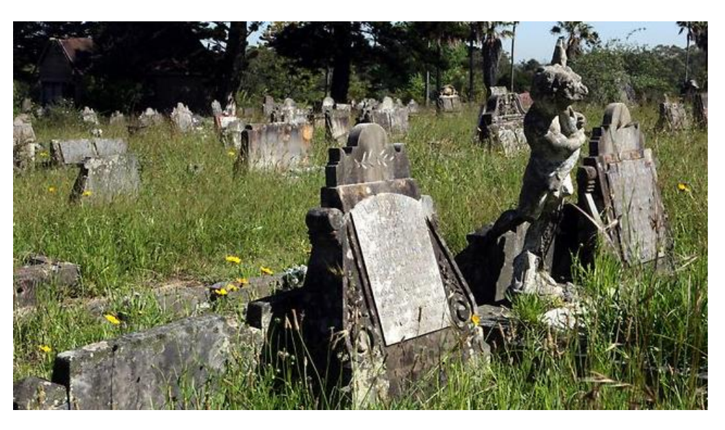
An older section of Rookwood Cemetery

(NOTE: the headstone was searched for by Gary & Irmgard Heap in 2020 with assistance from a lady in the Trust Office but no headstone was found. Arrow shows location of the Grave)