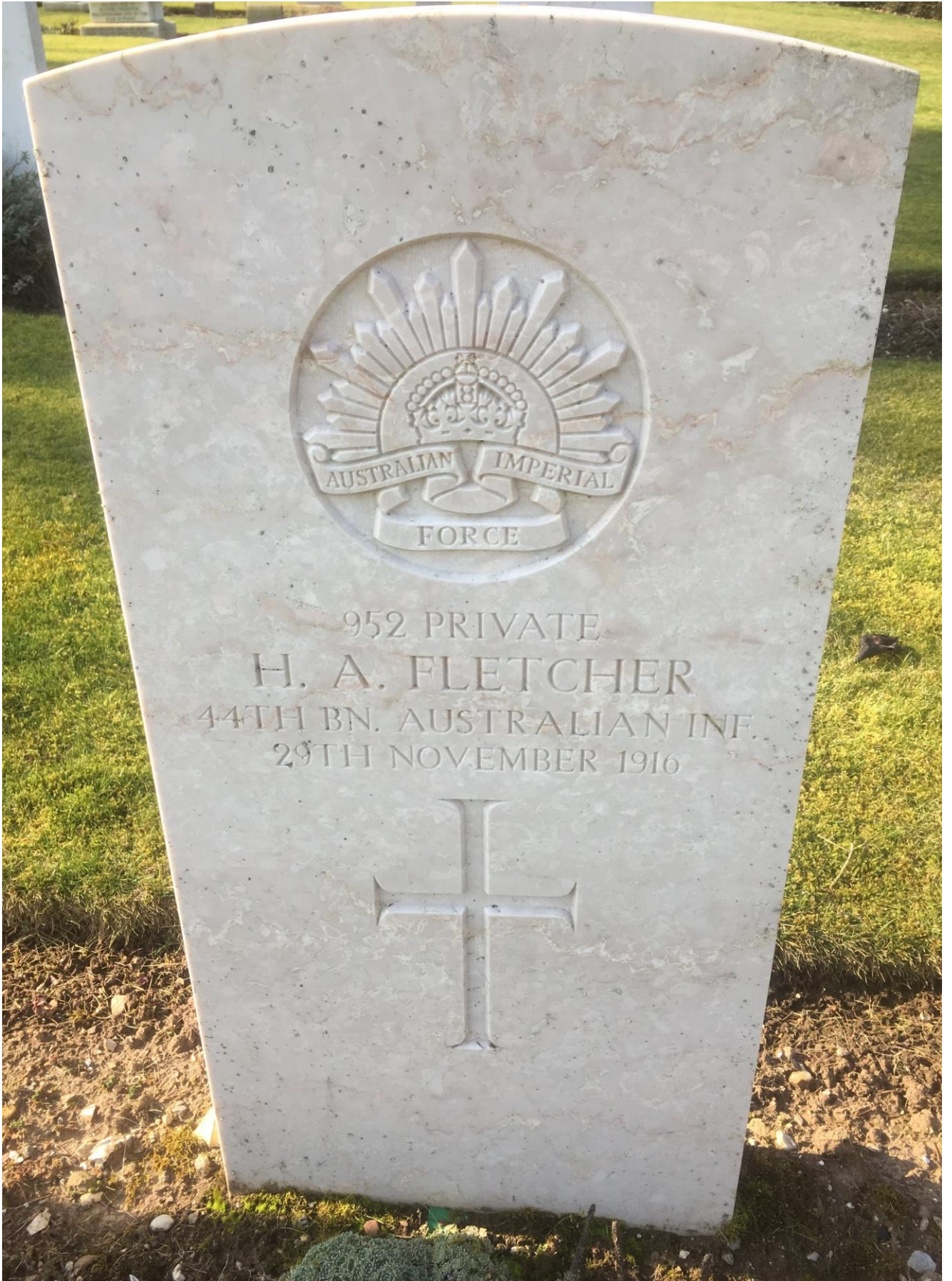
Photo of Private H. A. Fletcher's Commonwealth War Graves Commission Headstone in Tidworth Military Cemetery, Wiltshire, England.