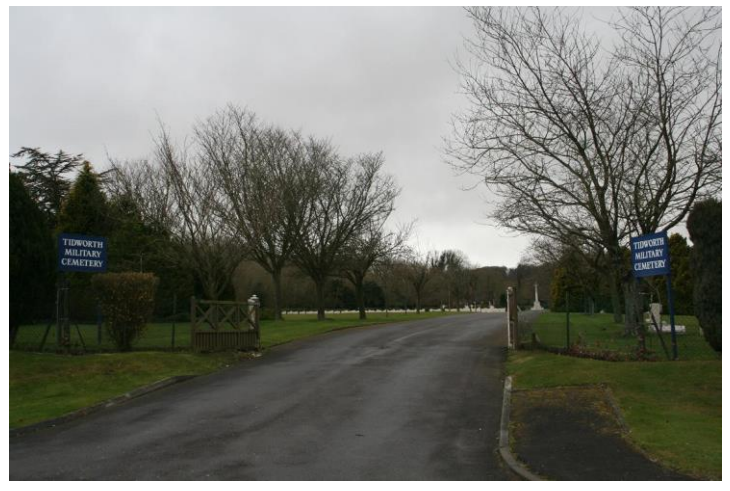
Tidworth Military Cemetery

The cemetery also contains 40 war graves of other nationalities, many of them Polish. (Information from CWGC)