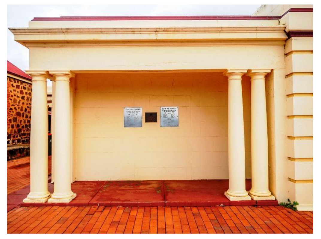
Mingenew Honour Roll

A. Fletcher is remembered on the Mingenew Honour Roll, located at Shire of Mingenew Office, 22 Victoria Road, Mingenew, Western Australia.