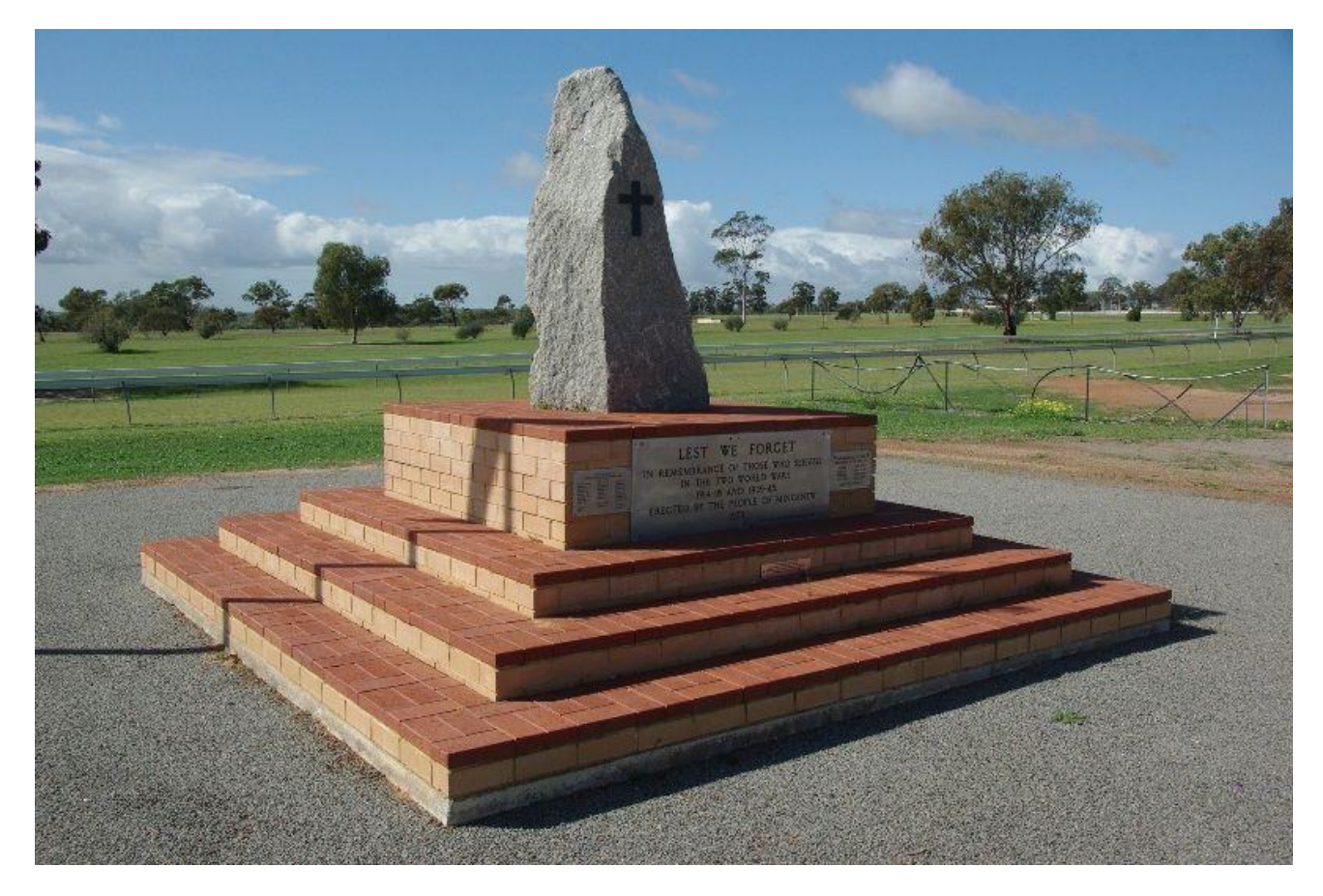
Mingenew War Memorial