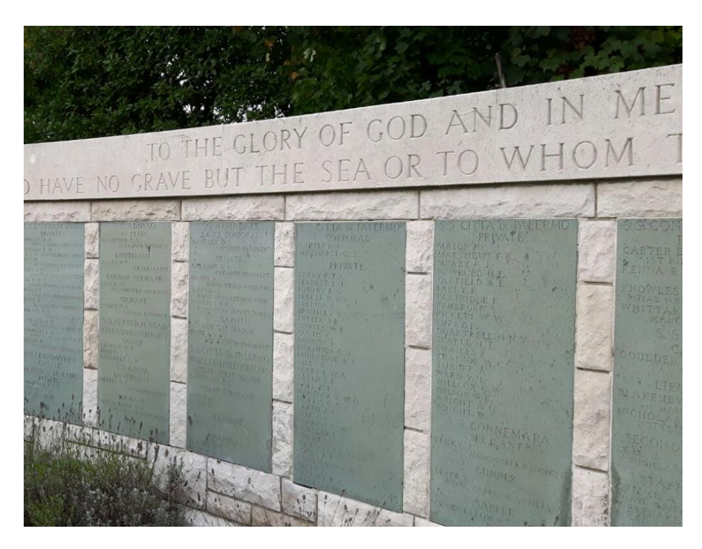
Name Panels behind Cross of Sacrifice