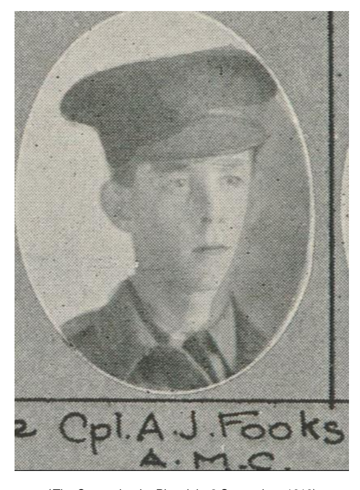
(The Queenslander Pictorial – 2 September, 1916)