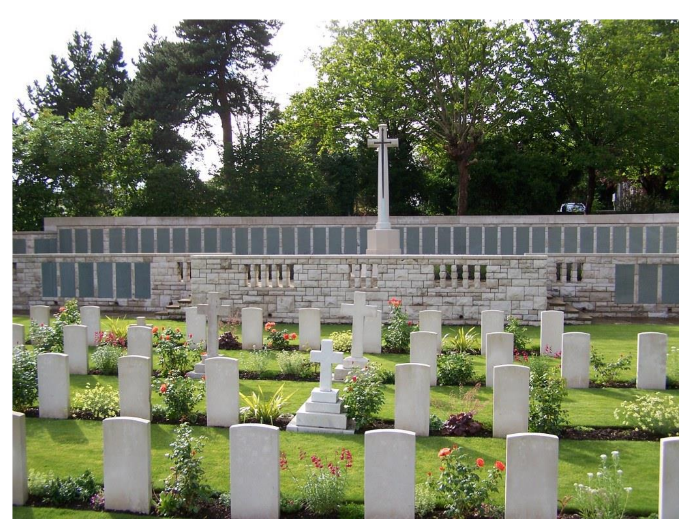
CWGC Graves in Hollybrook Cemetery with Cross of Sacrifice & Hollybrook Memorial