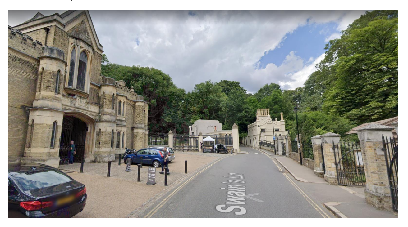
Highgate Cemetery with sign showing East (to right) & West (to left) (Streetview)