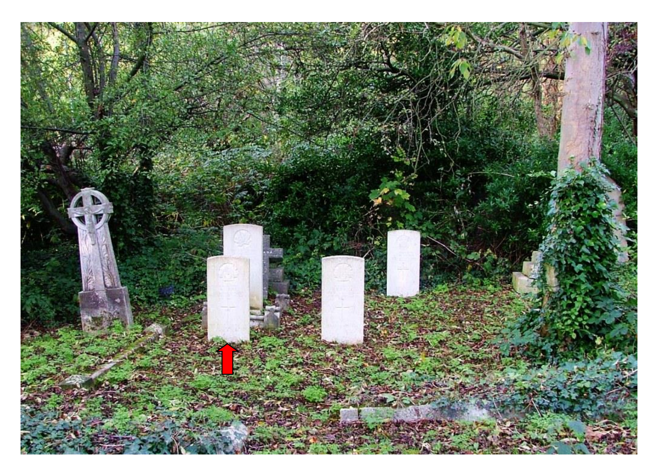
Sergeant Ford's Headstone (front left)