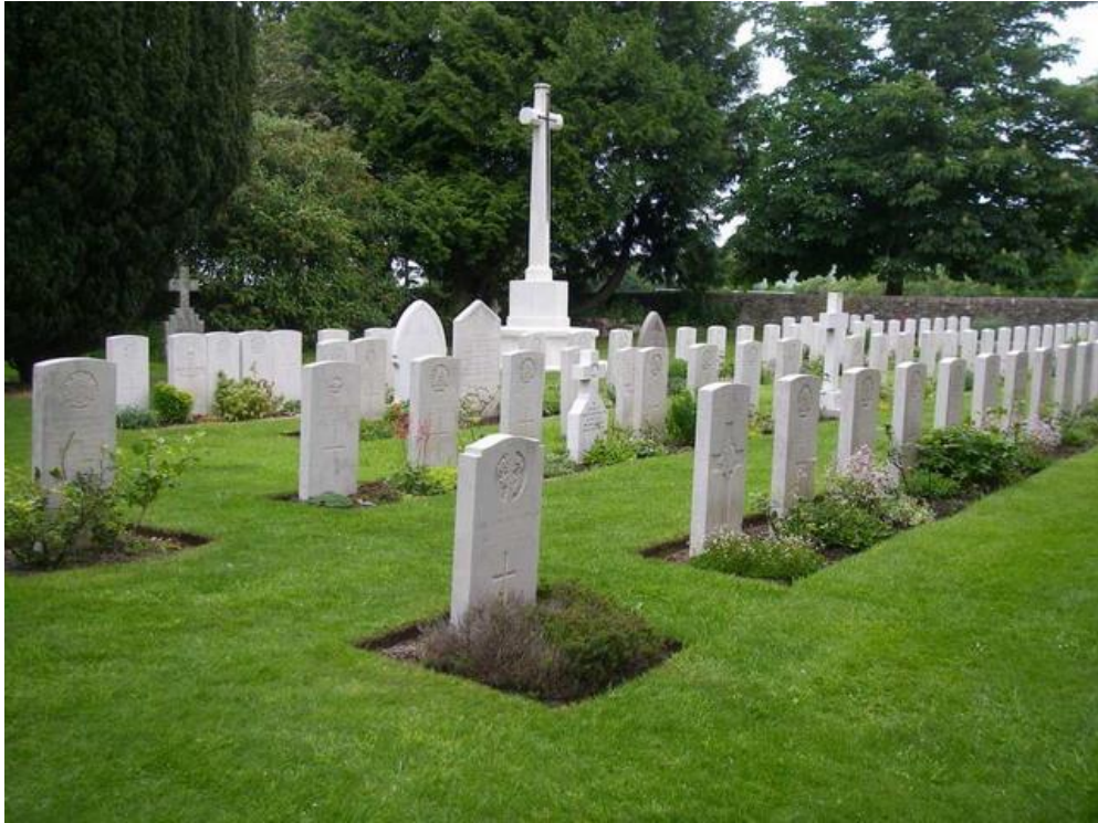
War Graves at Sutton Veny