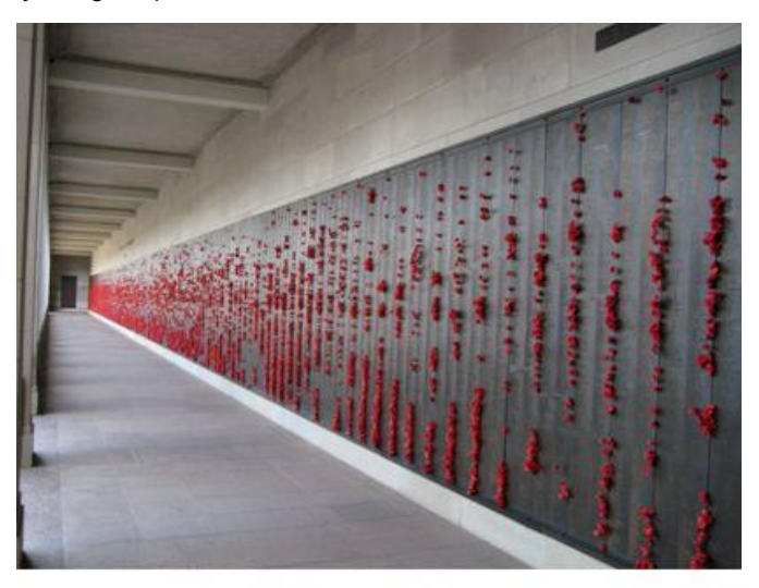
Roll Of Honour WW1 Australian War Memorial Canberra, Australia

(50 pages of Private Percy Forster's Service records are available for On Line viewing at National Archives of Australia website).