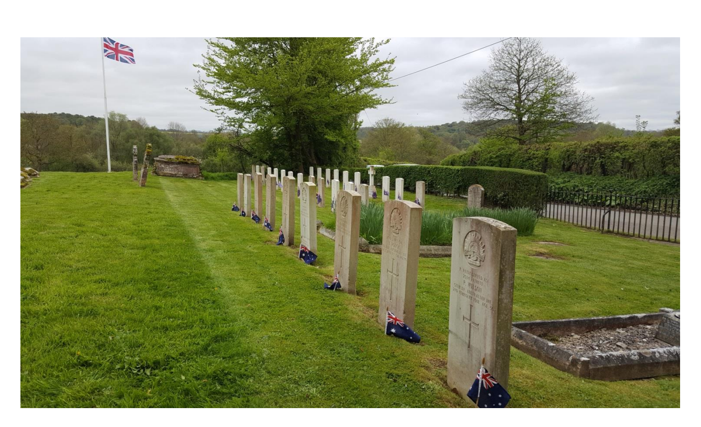
St. Edith's Churchyard, Baverstock