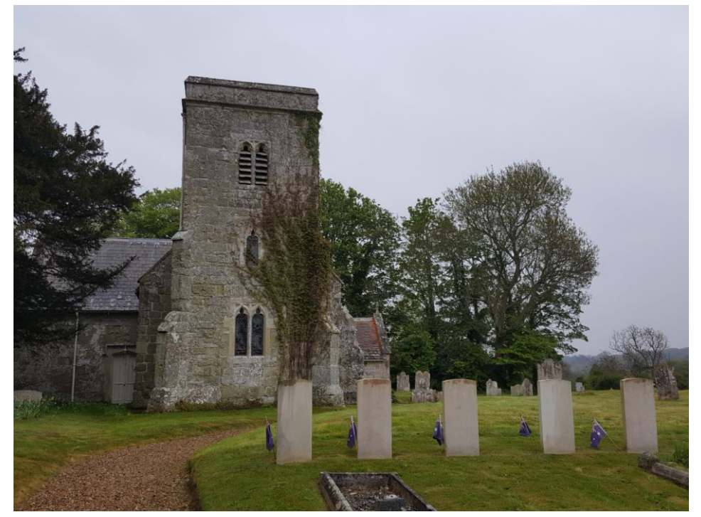
St. Edith's Churchyard, Baverstock

St. Edith's Churchyard, Baverstock contains 32 World War 1 War Graves – 3 London Regiment Graves in the south-west corner & 29 Australian War Graves.