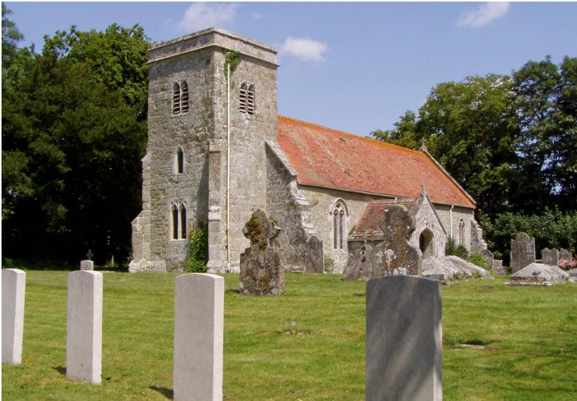
St. Edith's Churchyard, Baverstock, Wiltshire.