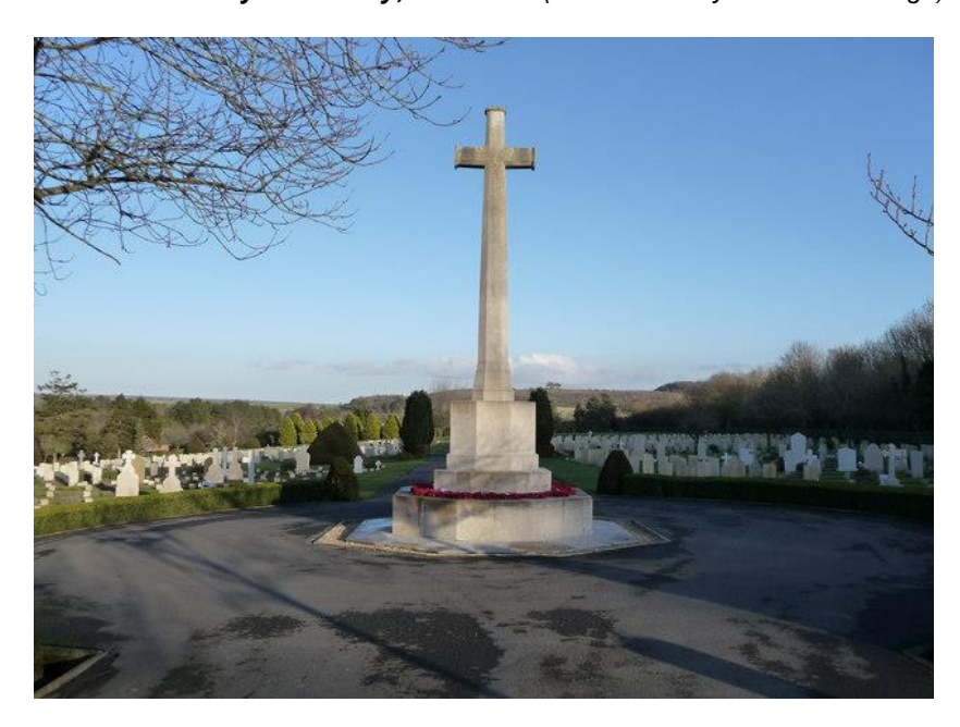
Tidworth Military Cemetery, Wiltshire