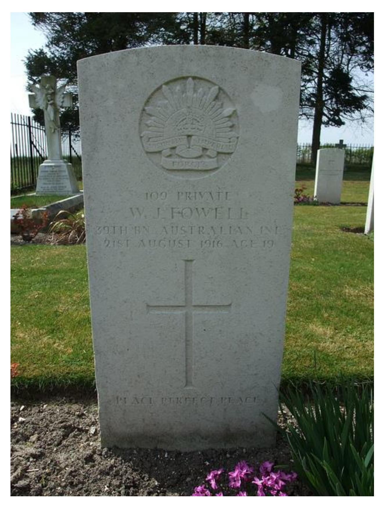
Photo of Pte W. J. Fowell's Headstone at Durrington Cemetery, Wiltshire.