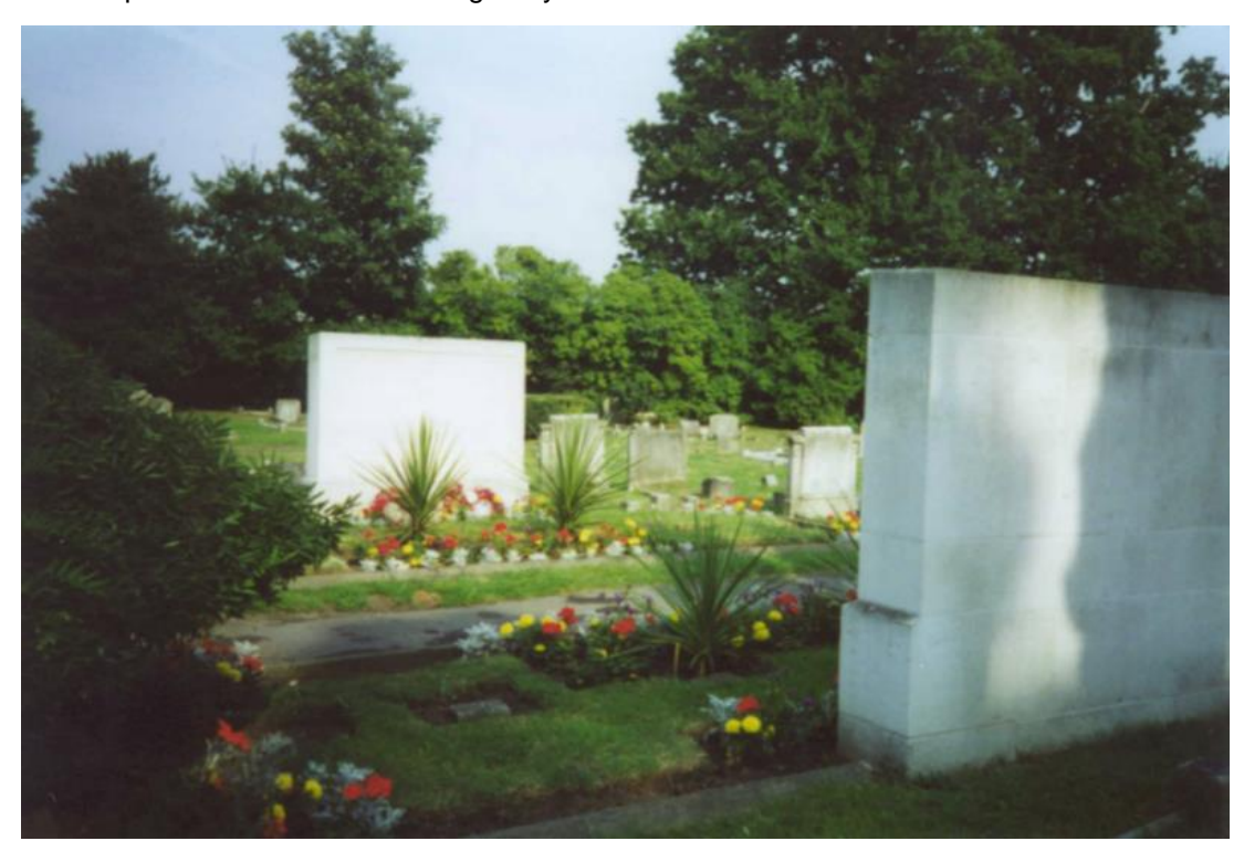
Screen Wall Memorials in Walton-On-Thames Cemetery & (below) St. Mary's Churchyard Walton-On-Thames

The commemoration of the casualties is on Screen Wall monuments rather than individual headstones as some graves contain more than one burial. Two plots containing eight grave spaces are directly in front of the two Screen Walls and the other plots are elsewhere in the graveyard.