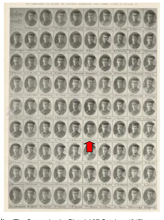
Queensland World War 1 Soldier Portraits (The Queenslander Pictorial 27 October, 1917)