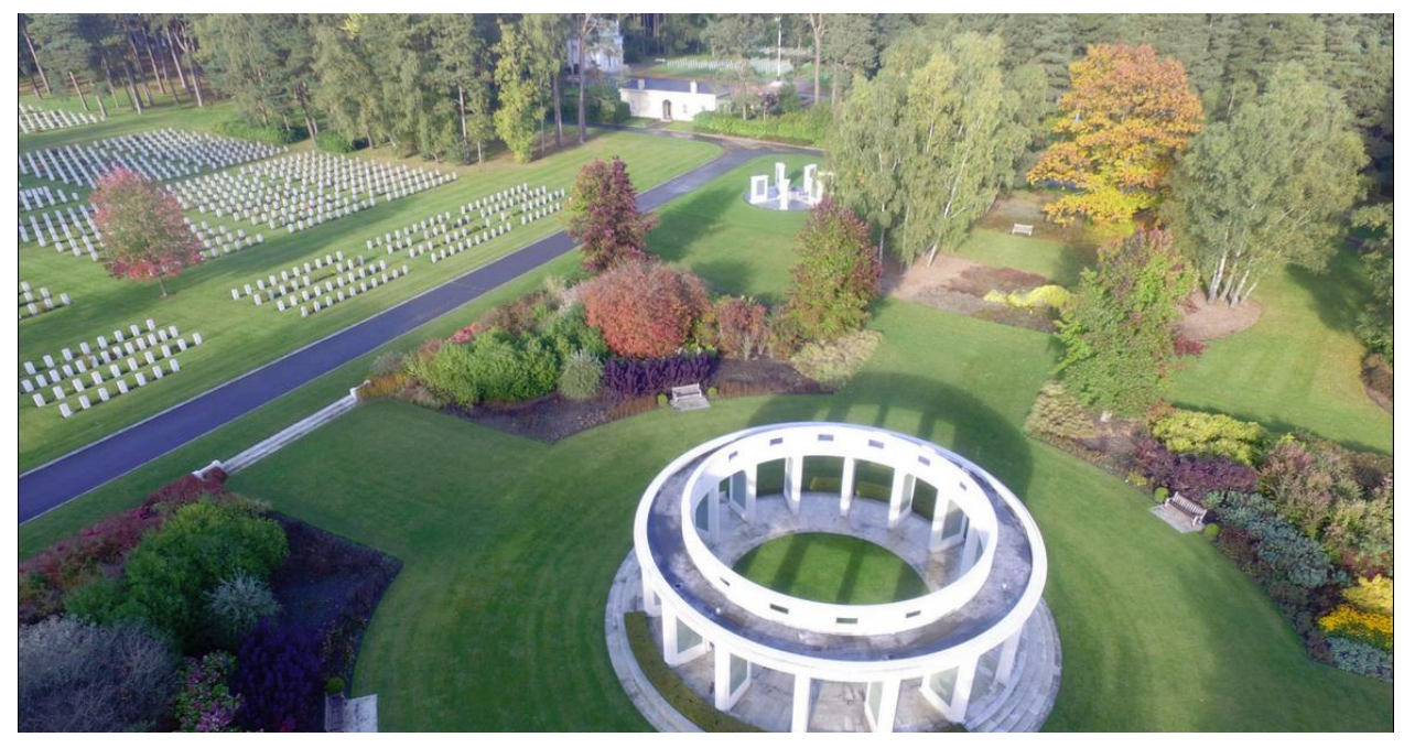
Brookwood Military Cemetery

There are 446 Australian War Graves in Brookwood Military Cemetery – 351 from World War 1 & 95 from World War 2.