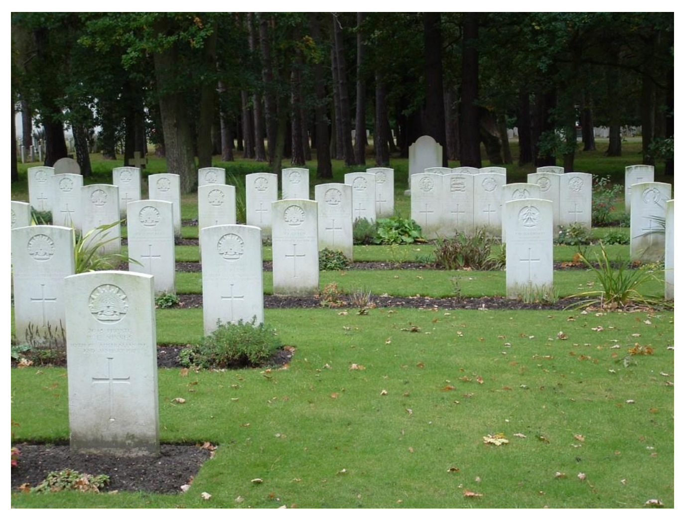
Australian Graves in Brookwood Military Cemetery