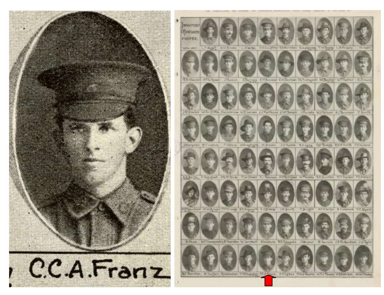
Queensland World War 1 Soldier Portraits (The Queenslander Pictorial 24 February, 1917)