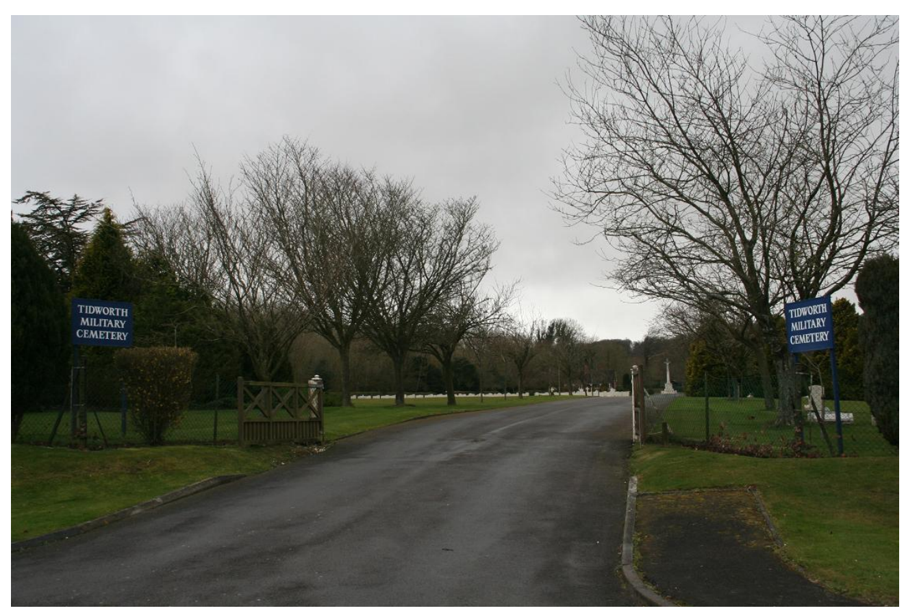
Tidworth Military Cemetery