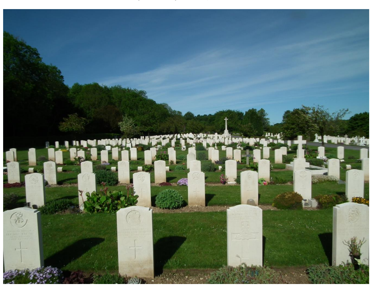
Tidworth Military Cemetery, Wiltshire