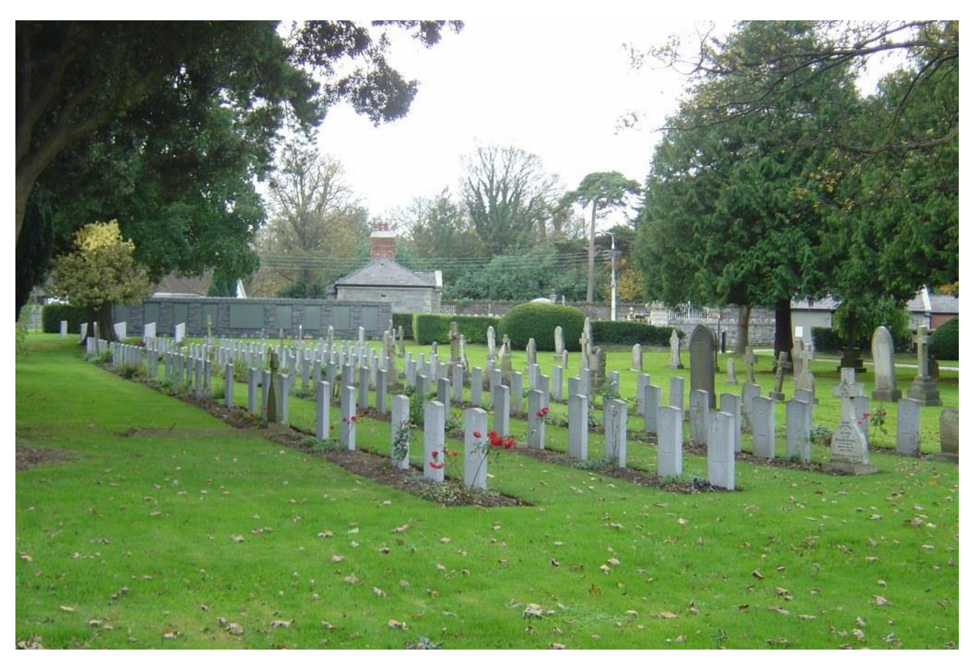
Grangegorman Military Cemetery