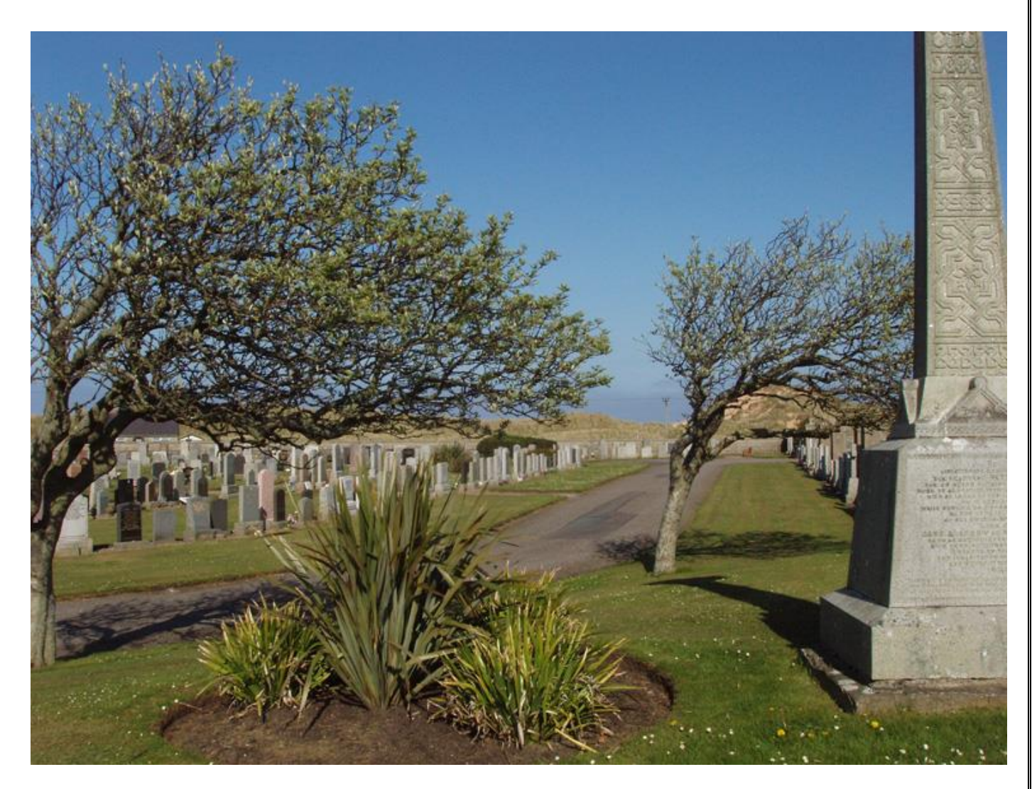
Kirkton Cemetery, Fraserburgh