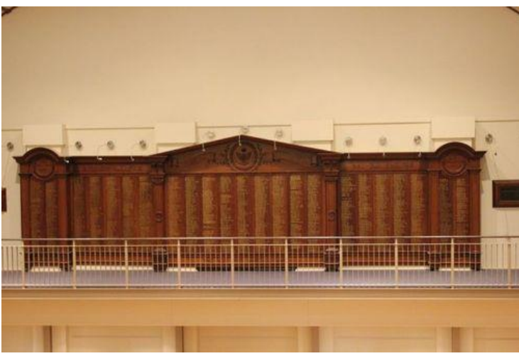
Unley City Honour Roll

C. G. French is remembered on the Unley City Honour Roll, located at Town Hall, Unley Road & Oxford Terrace, Unley, South Australia.