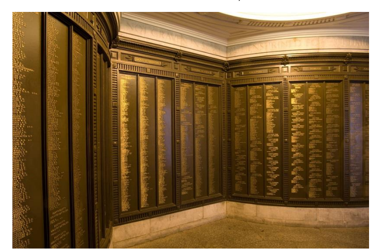
National War Memorial – Adelaide