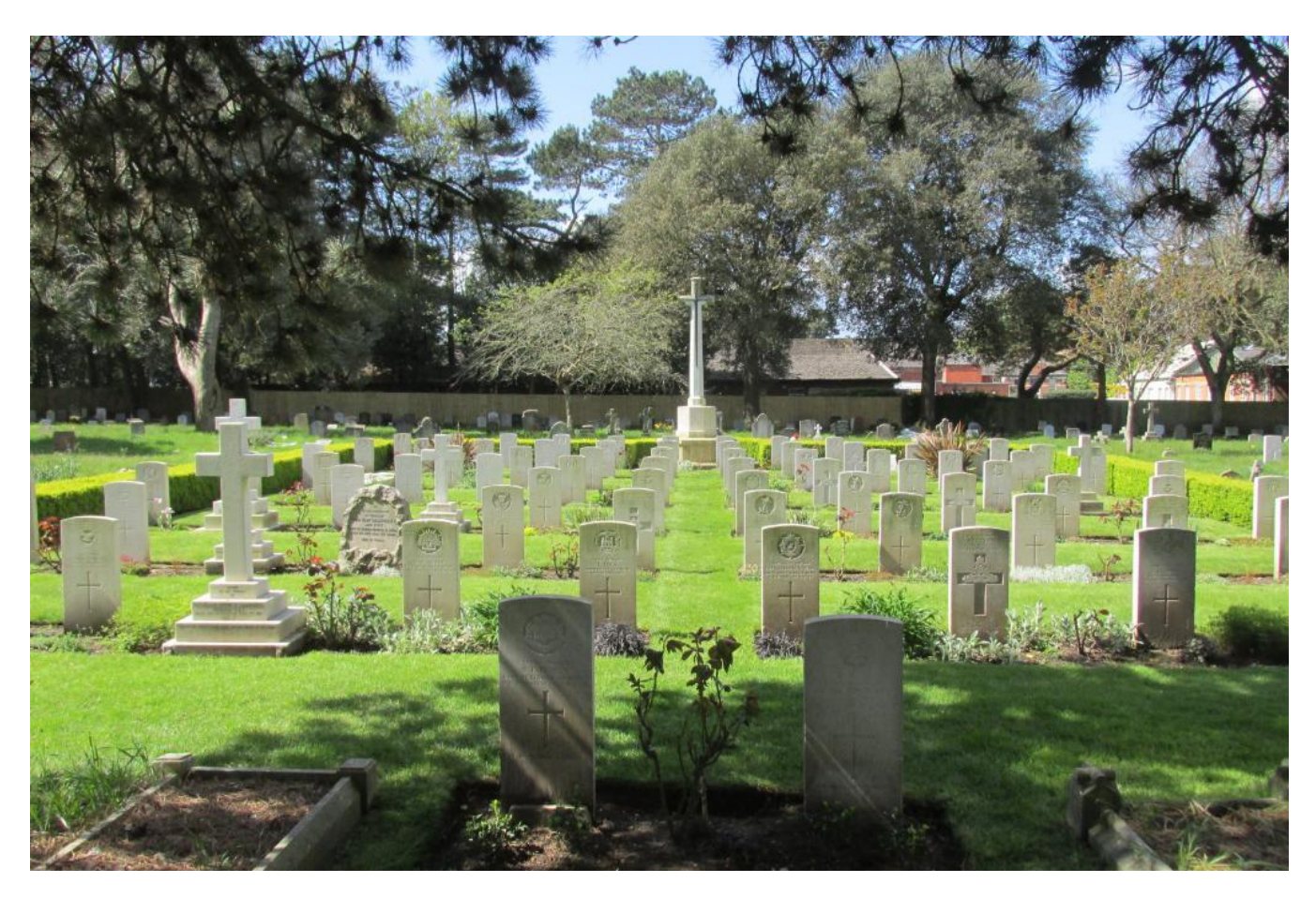
Bournemouth East Cemetery