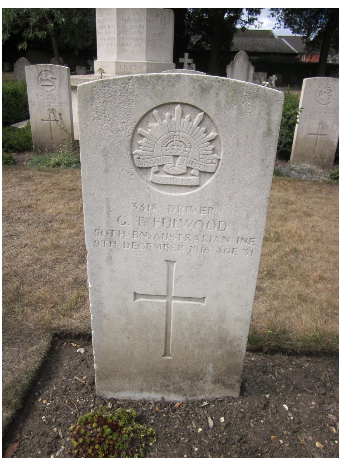
Photo of Driver G. T. Fulwood's Commonwealth War Graves Commission Headstone in Bournemouth East Cemetery, Bournemouth, Dorset, England