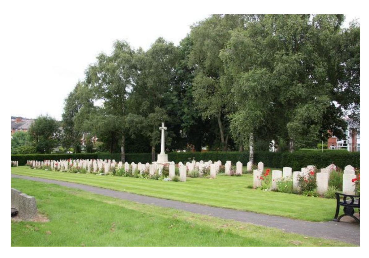
Exeter Higher Cemetery showing Cross of Sacrifice & World War 2 War Graves