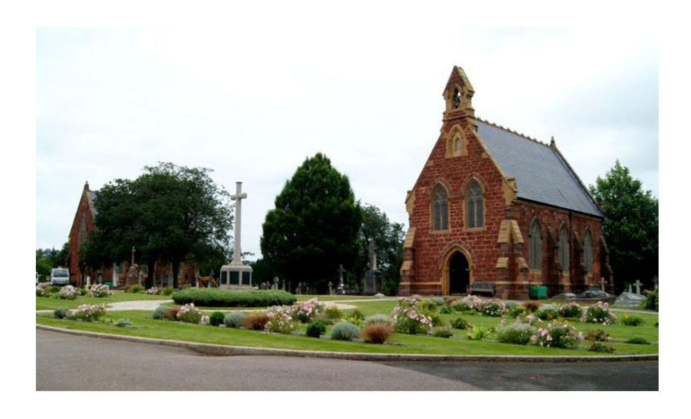
The World War 1 plots near the Memorial with plants & flowers between the named granite grave markers