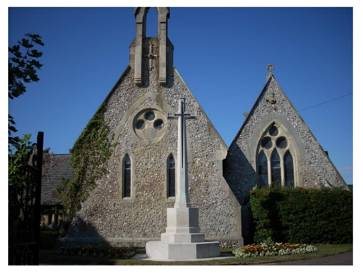
Cross of Sacrifice at Ocklynge Cemetery, Eastbourne, Sussex

During World War 1, Eastbourne contained a very large Military Convalescent Hospital, originally called Eastbourne Military Hospital, which opened in April, 1915. From January, 1917 to October, 1919 it became No. 14 Canadian General Hospital.