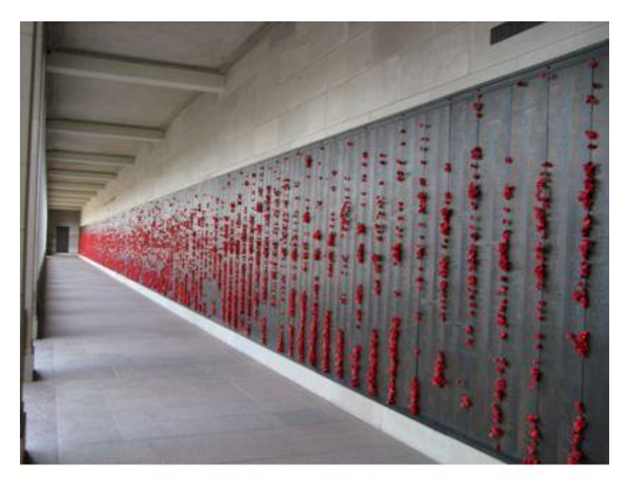
Roll Of Honour WW1 Australian War Memorial Canberra, Australia

Private W. B. Gemmell is commemorated on the Roll of Honour, located in the Hall of Memory Commemorative Area at the Australian War Memorial, Canberra, Australia on Panel 139.