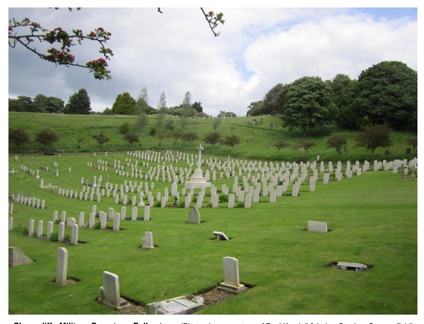
Shorncliffe Military Cemetery, Folkestone