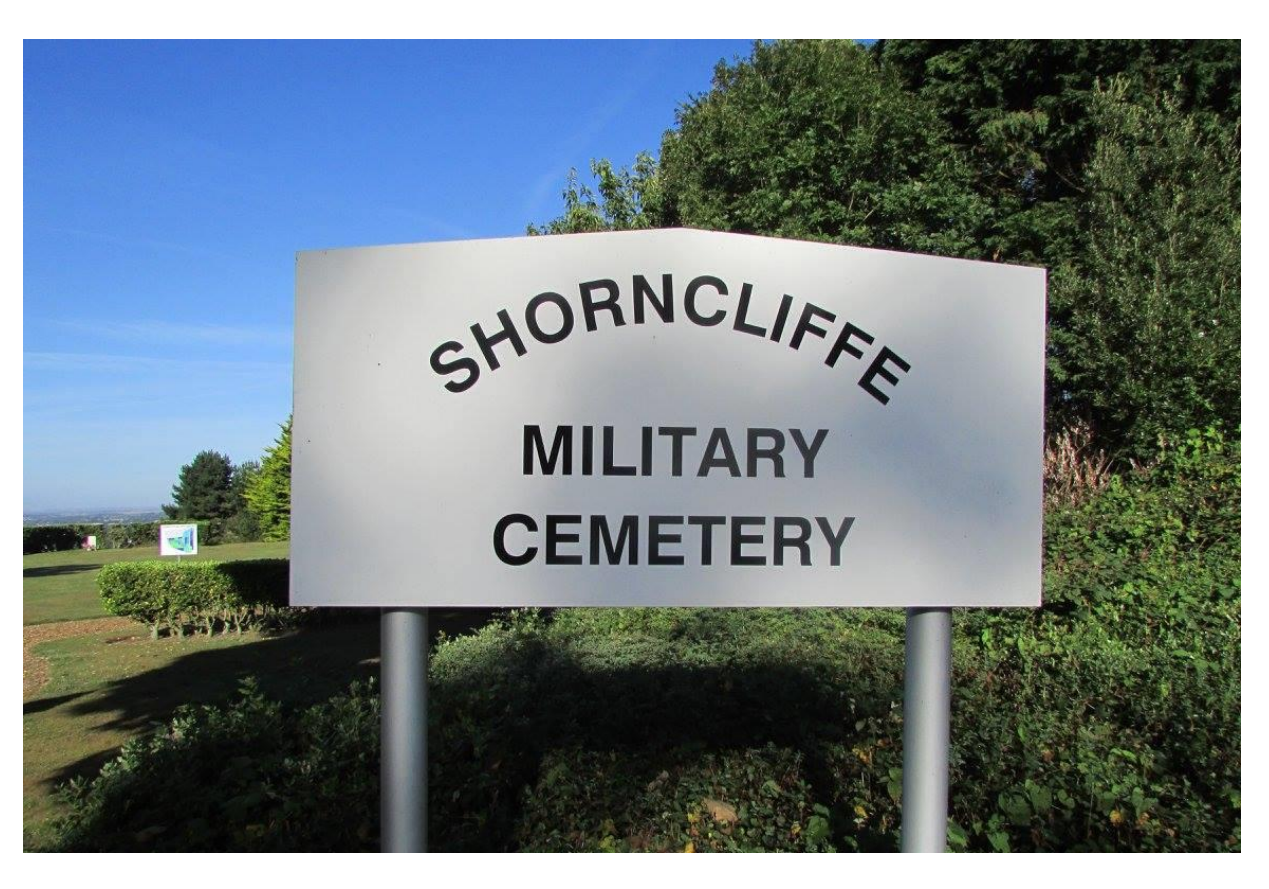
Shorncliffe Military Cemetery, Folkestone