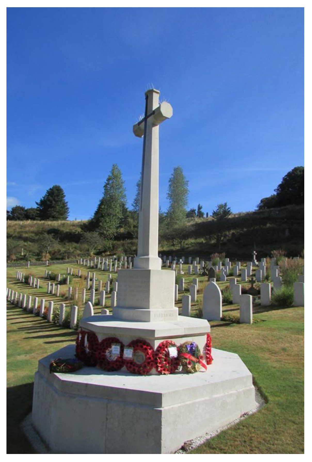
Cross of Sacrifice