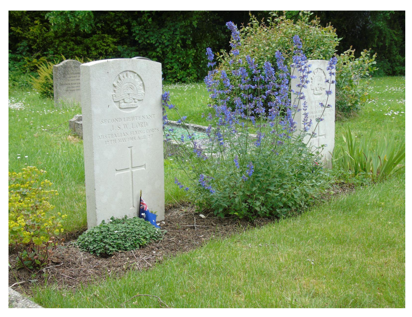
Photo of the 2 Australian Flying Corps Headstones – 2nd Lieut. Lord (left) & Lieut. George (right)