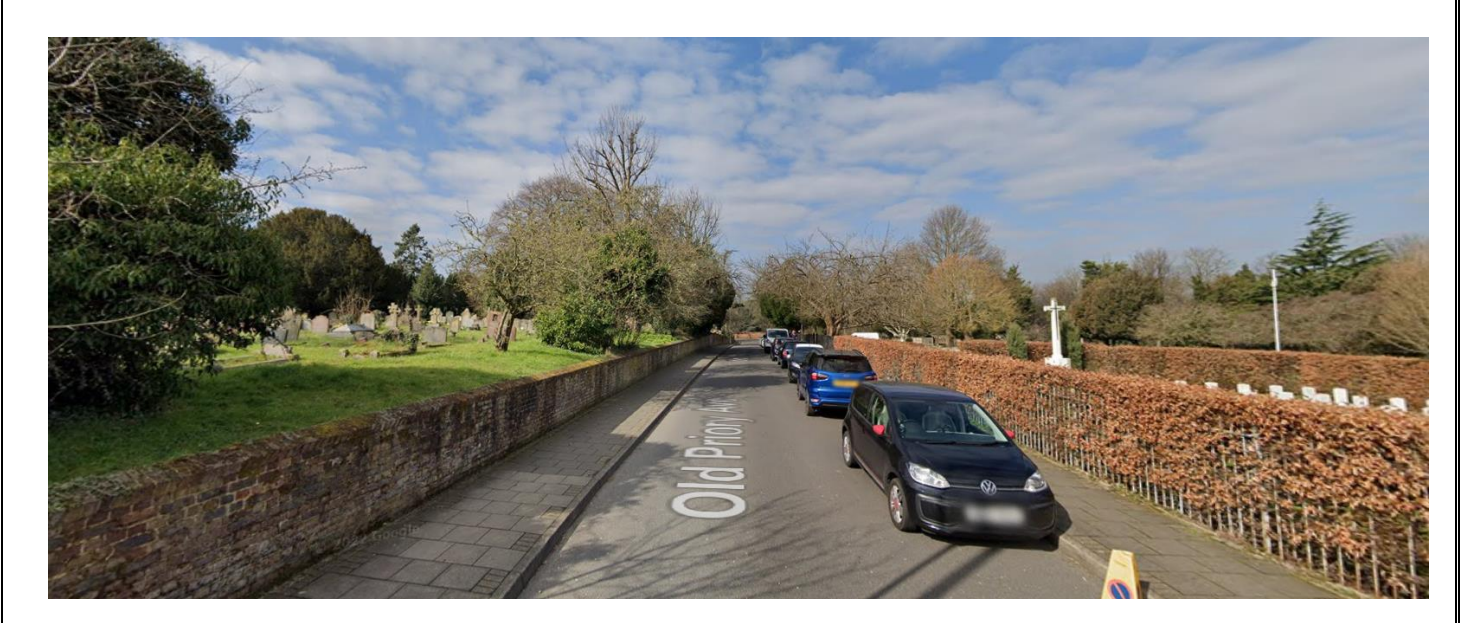
All Saints Churchyard (left) & Extension (right), Orpington (Google Street view)