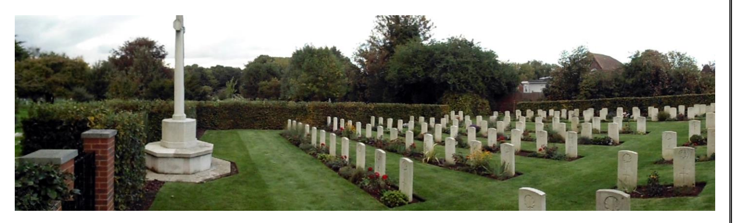
All Saints Churchyard Extension, Orpington