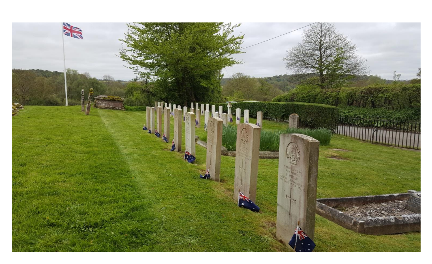
St. Edith's Churchyard, Baverstock