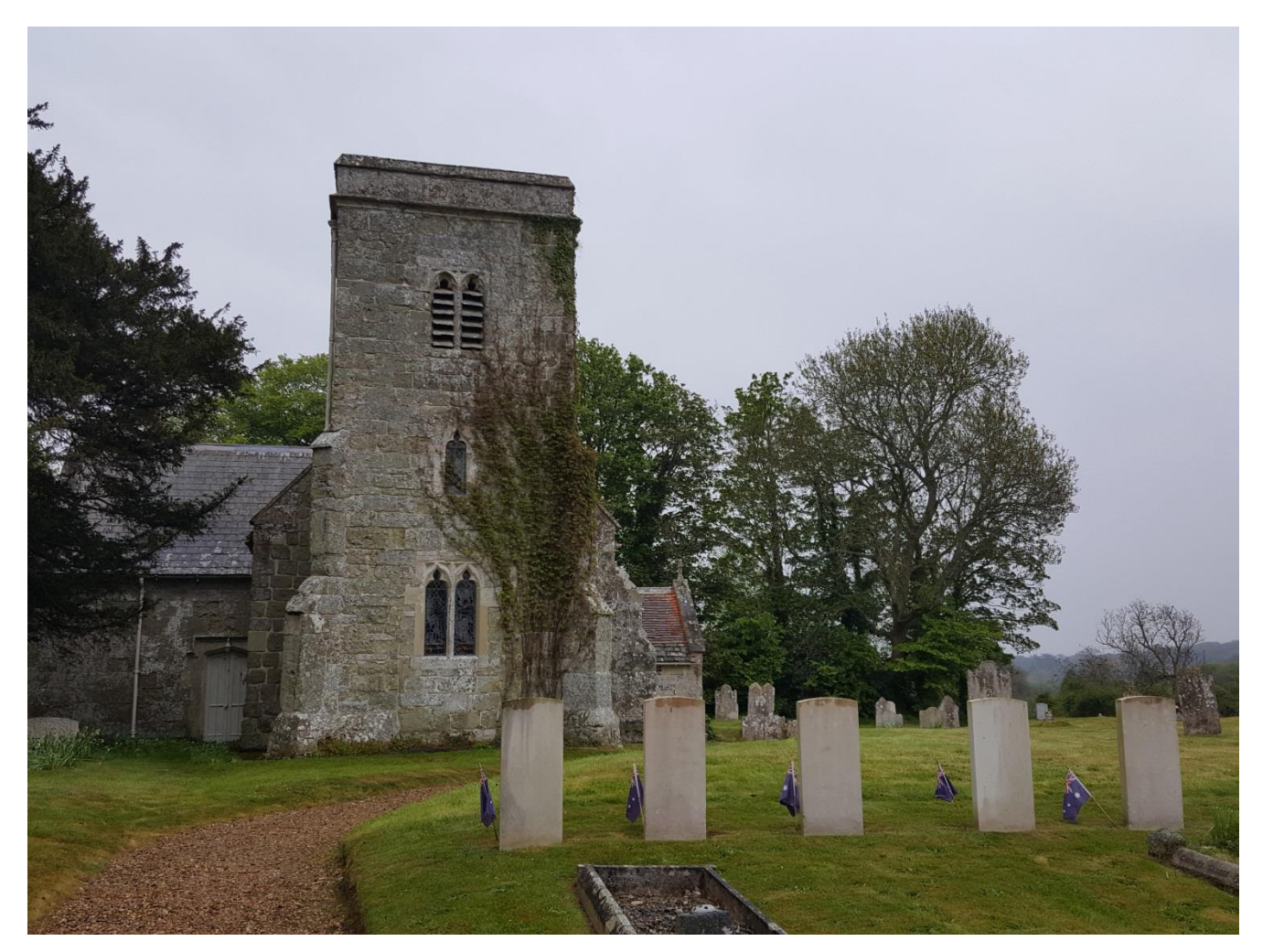
St. Edith's Churchyard, Baverstock

St. Edith's Churchyard, Baverstock contains 32 World War 1 War Graves – 3 London Regiment Graves in the southwest corner & 29 Australian War Graves.