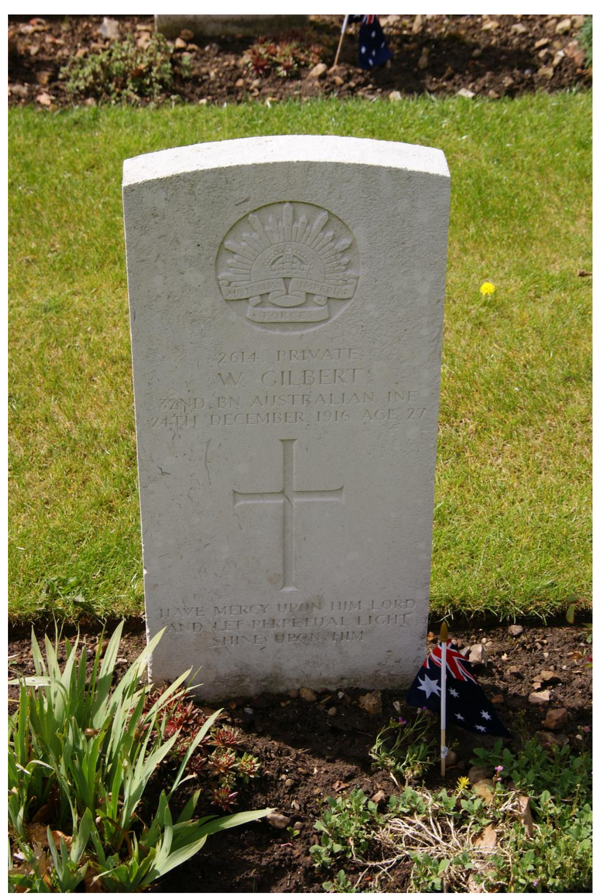
Photo of Private W. Gilbert's Commonwealth War Graves Commission Headstone at Compton Chamberlayne War Graves Cemetery, Wiltshire, England.