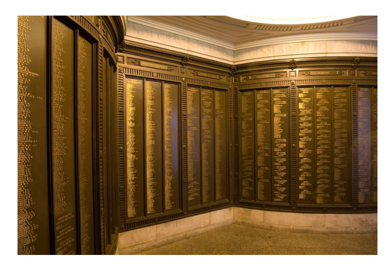
National War Memorial – Adelaide