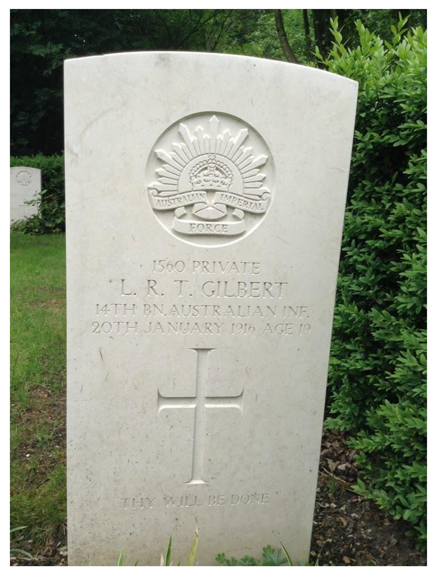
Photo of Private L. R. T. Gilbert's Commonwealth War Graves Commission Headstone in All Saints Cemetery, Nunhead, Greater London, England.