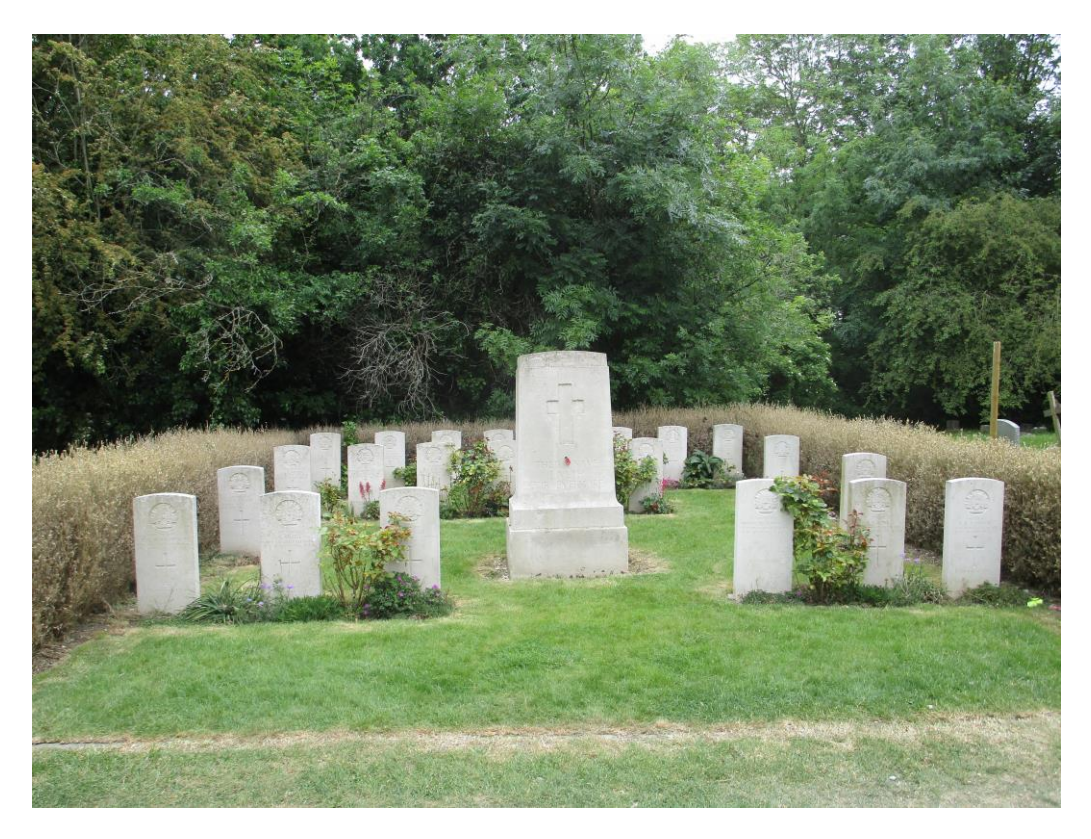
Australian War Graves in All Saints Cemetery, Nunhead