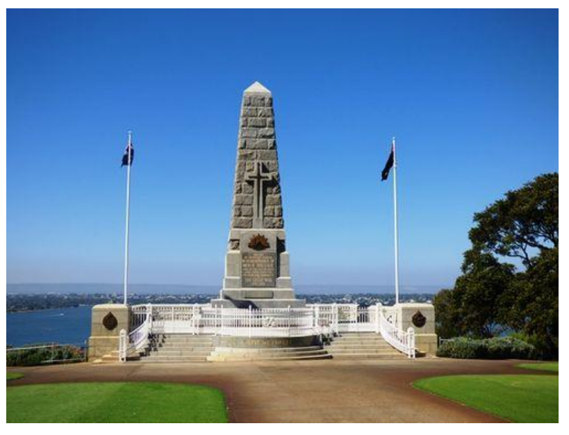
Western Australia State War Memorial Cenotaph, Kings Park

The heavy concrete foundations are supplemented by heavy brick walls which enclose an inner chamber or crypt. The walls surrounding the crypt are covered with The Roll of Honour; marble tablets which list under their units the names of more than 7,000 members of the services killed in action or as a result of World War One.