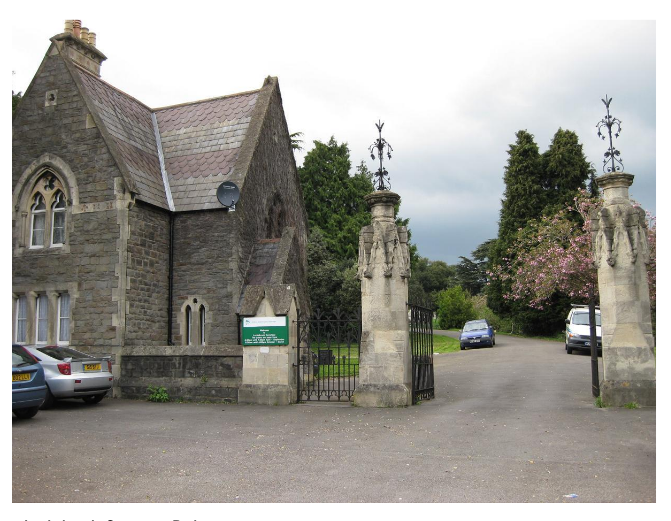
Locksbrook Cemetery, Bath