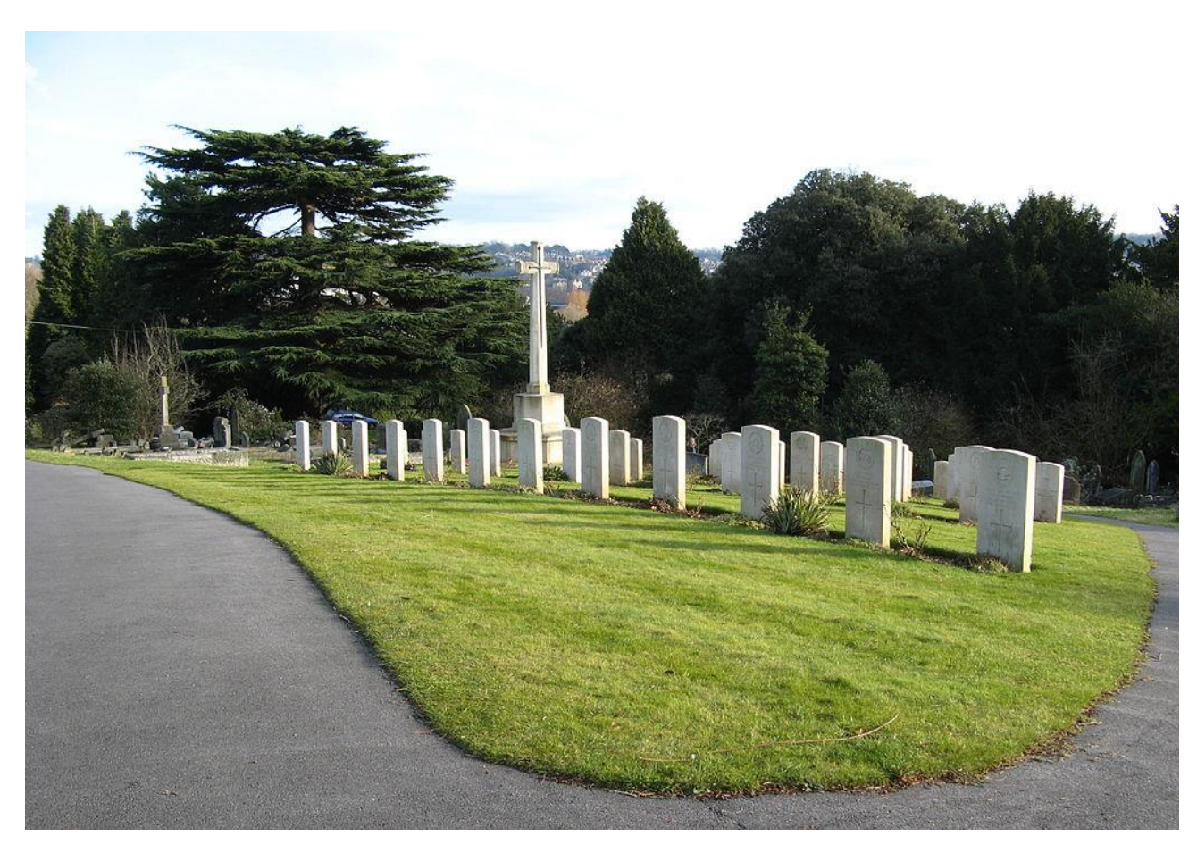
World War 1 War Graves in Locksbrook Cemetery, Bath