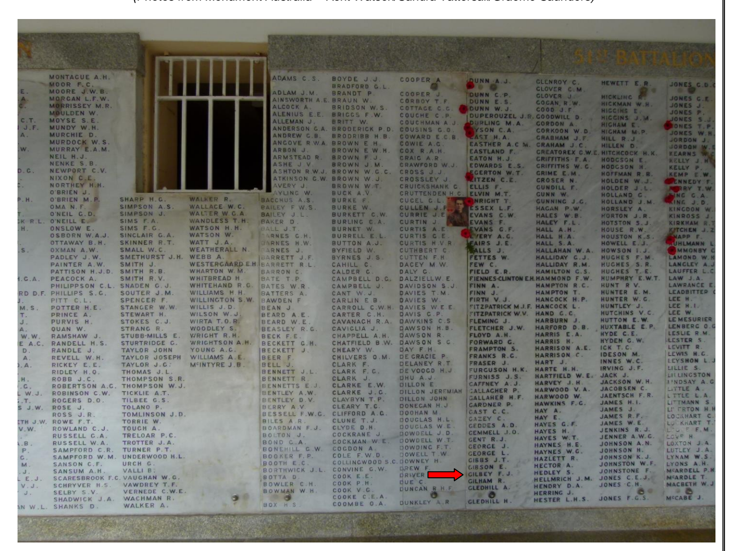
51st Battalion Panel