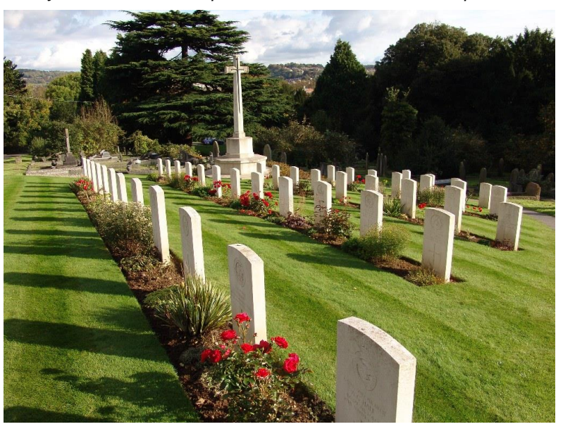
War Graves in Locksbrook Cemetery, Bath

The licence having been readily accorded, the Corporation has now carried their promise into effect, ....."