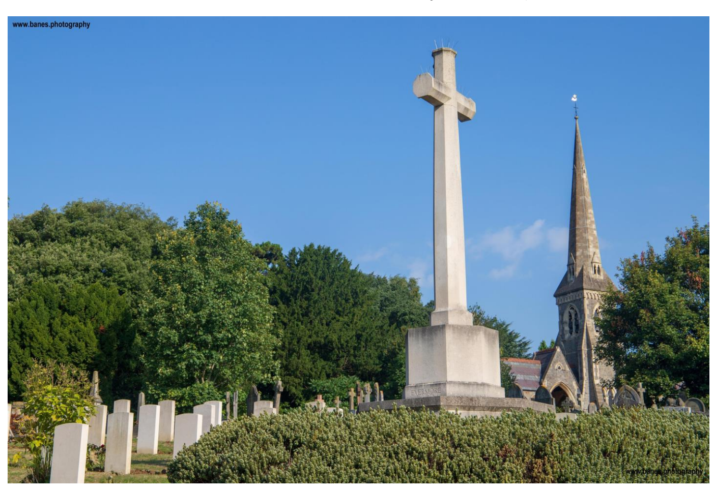
Locksbrook Cemetery, Bath (Photo by Colin Peachey – Find a Grave)