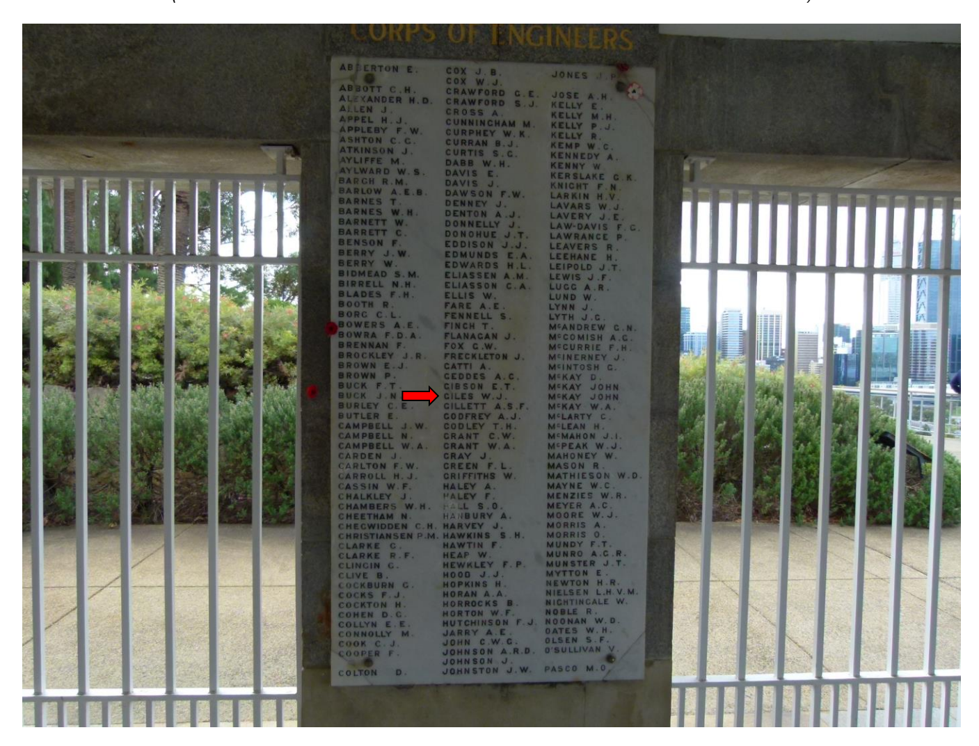
Corps of Engineers Panel