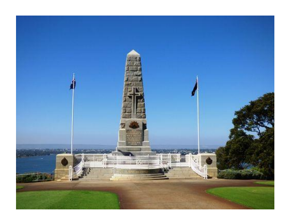
Western Australia State War Memorial Cenotaph, Kings Park

The heavy concrete foundations are supplemented by heavy brick walls which enclose an inner chamber or crypt. The walls surrounding the crypt are covered with The Roll of Honour; marble tablets which list under their units the names of more than 7,000 members of the services killed in action or as a result of World War One.