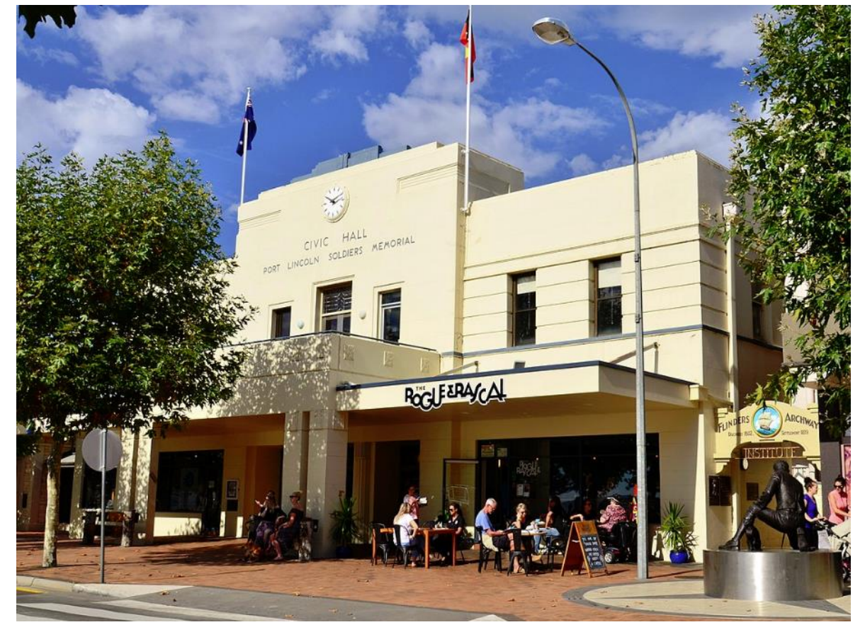
Port Lincoln Soldiers Memorial Civic Hall