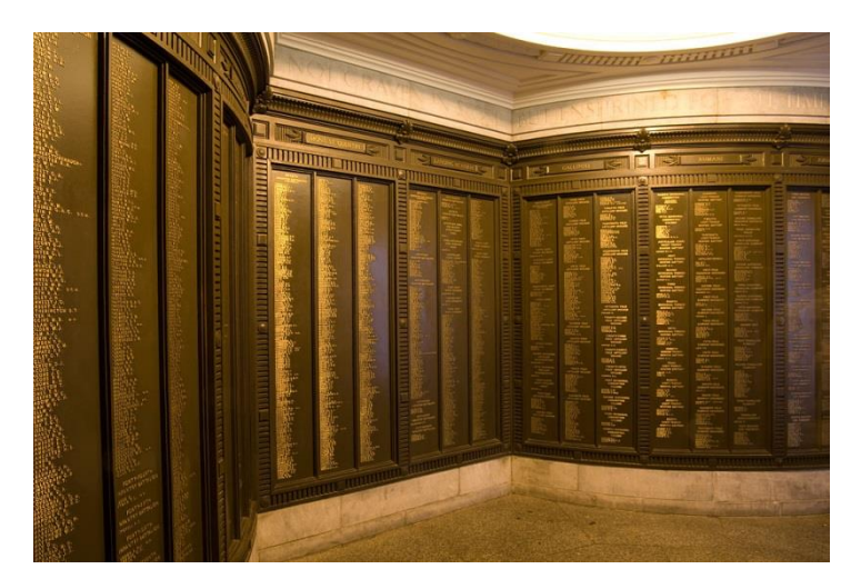
National War Memorial – Adelaide