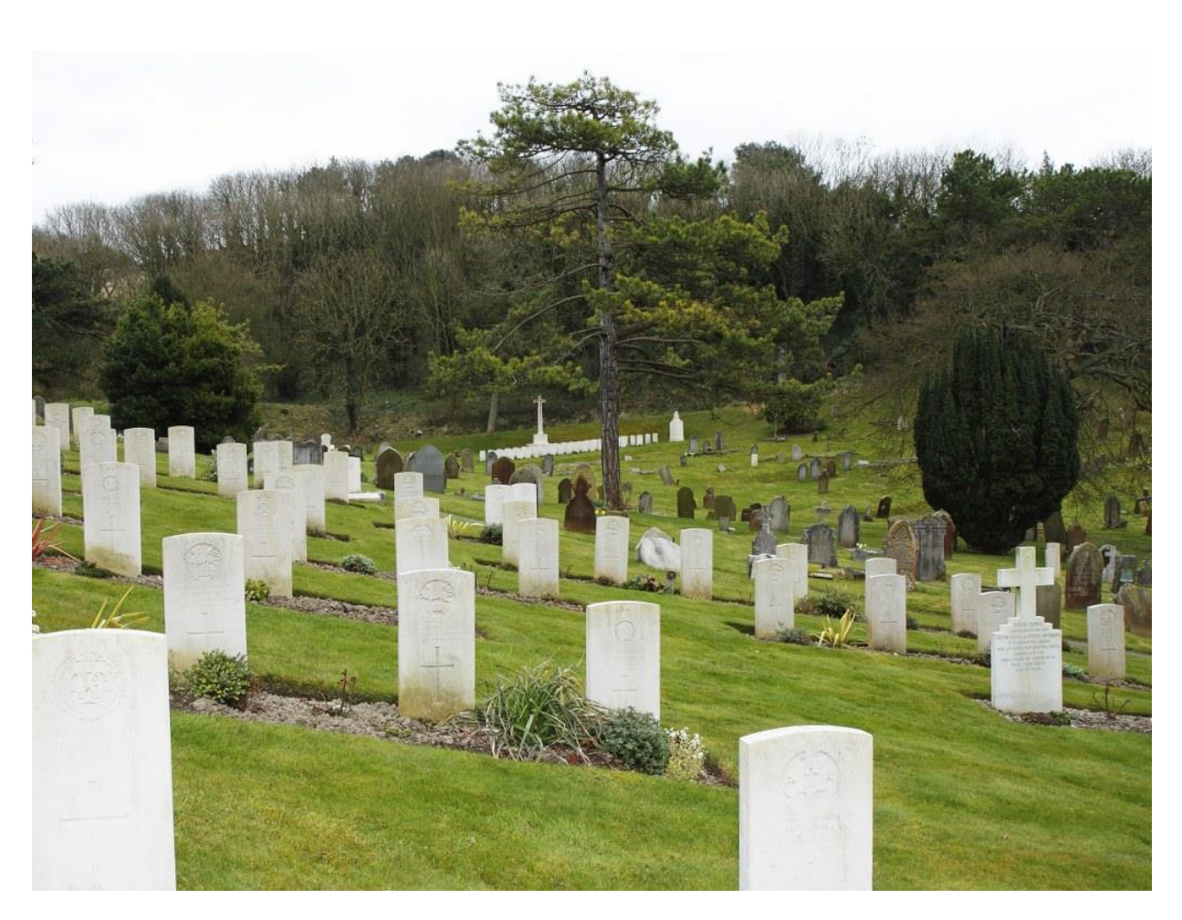
St. James Churchyard Cemetery, Dover