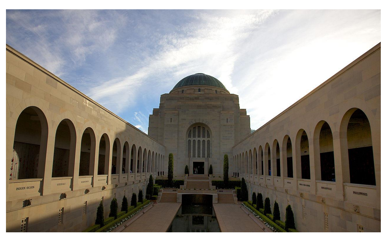
Commemorative Area of the Australian War Memorial