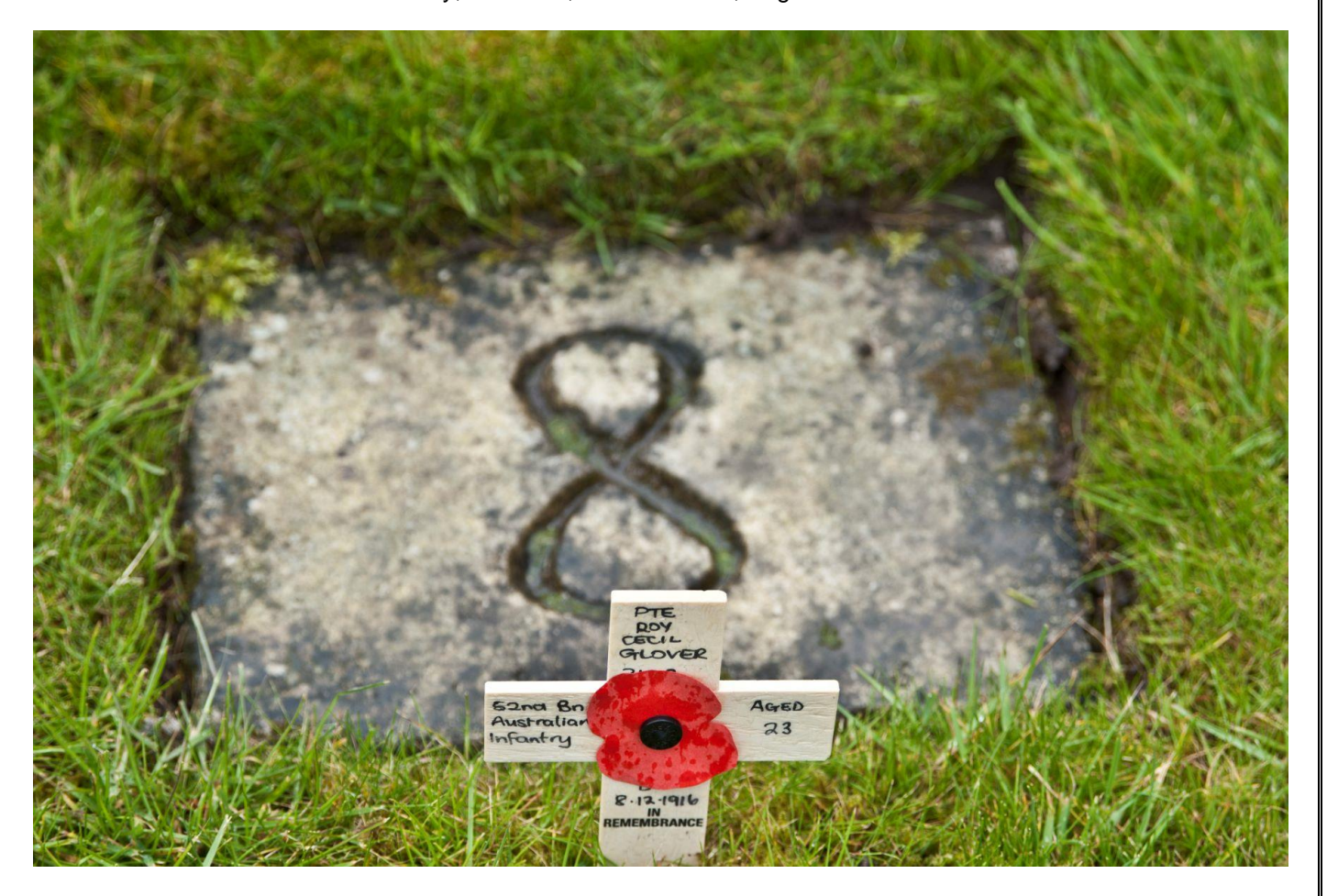
ANZAC Day Commemorations