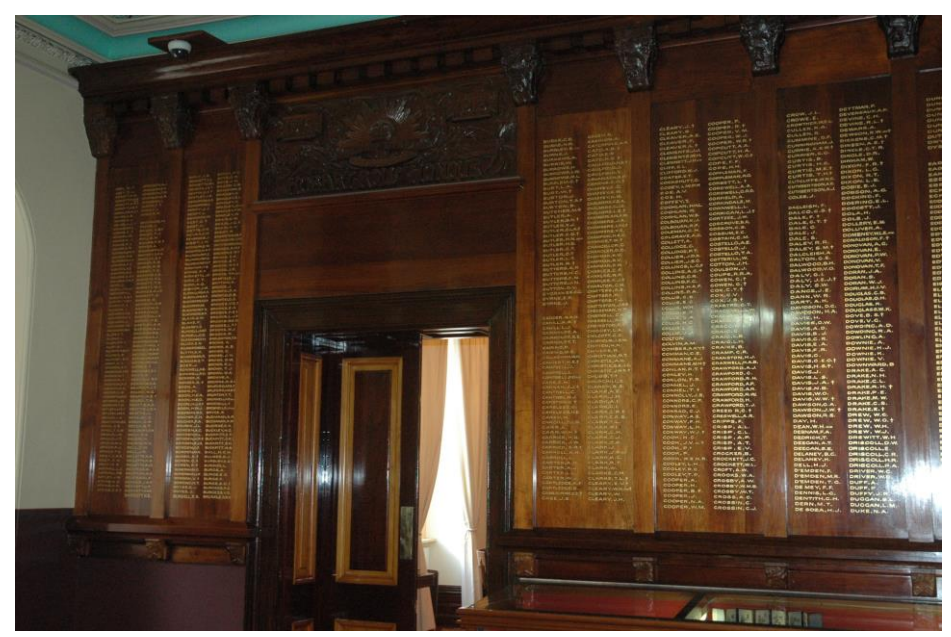
Hobart Roll of Honour

R. C. Glover is remembered on the Hobart Roll of Honour, located in Town Hall Foyer, 50 Macquarie Street, Hobart, Tasmania.