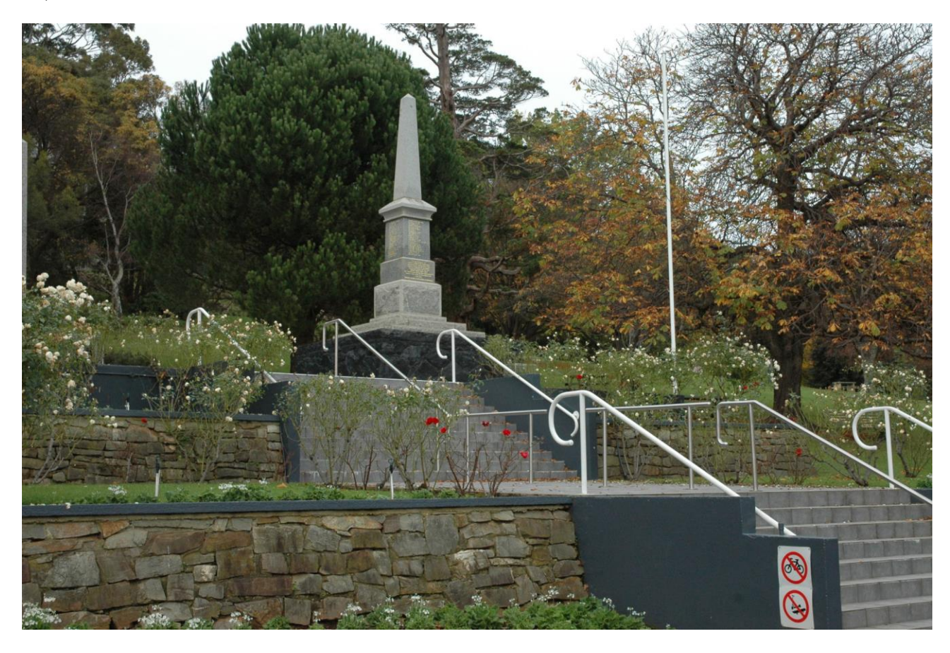
Burnie War Memorial