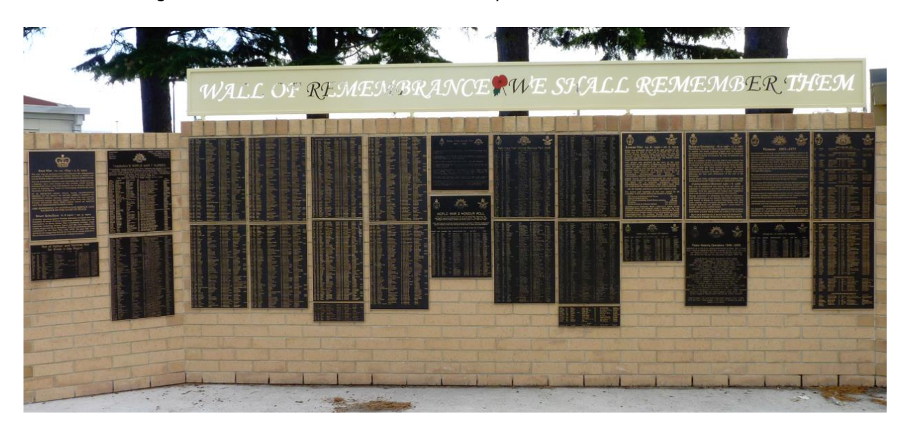
Wall of Remembrance, St. Helens, Tasmania

"What these men did nothing can alter now. The good and the bad, the greatness and the smallness of their story will stand. Whatever of glory it contains nothing now can lessen. It rises, as it will always rise, above the mists of ages, a monument to great hearted men; and for their nation, a possession forever."