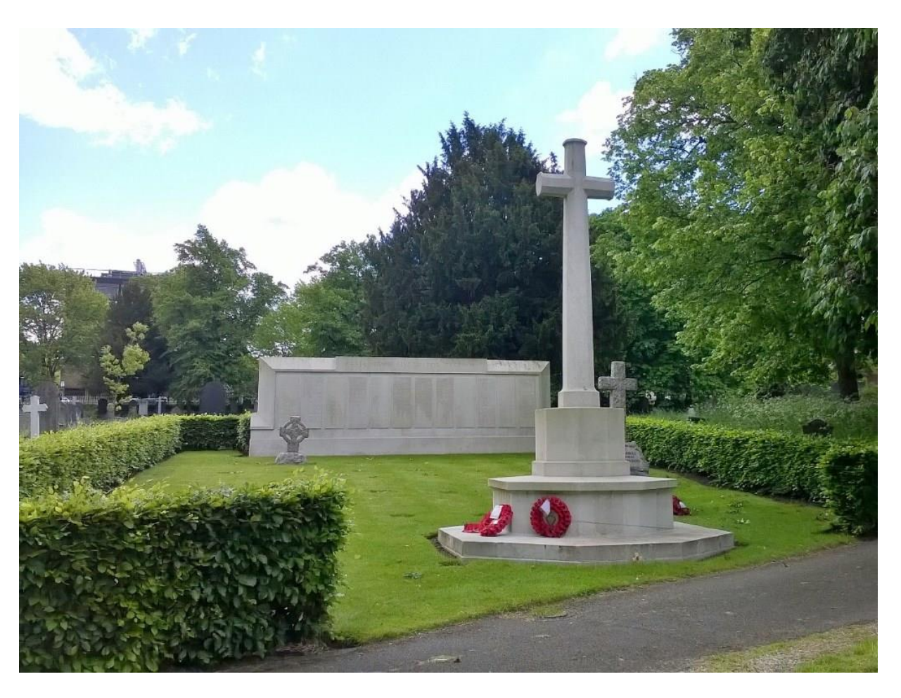
Cross of Sacrifice & Screen Wall in Welford Road Cemetery, Leicester