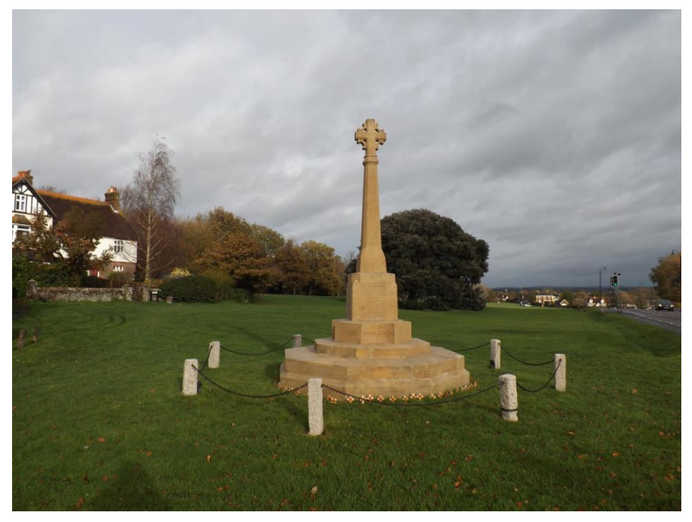
Ringmer Village War Memorial

Charles Godden is remembered on the Ringmer Village War Memorial, located on Village Green, Lewes Road, Ringmer, East Sussex, England.