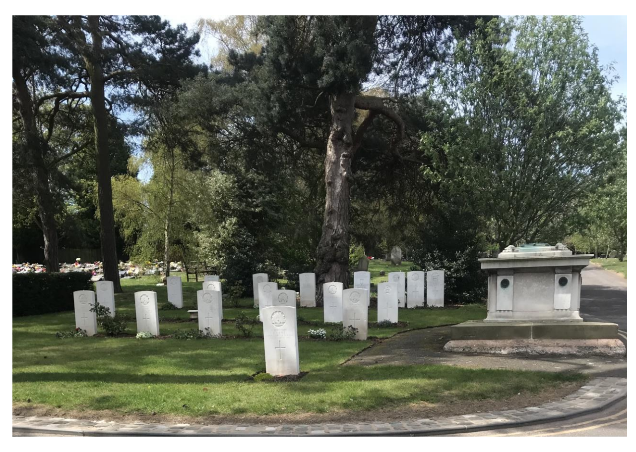
Stourbridge Cemetery showing Australian WW1 War Graves