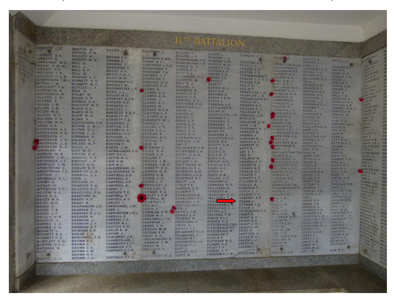
11th Battalion Panel