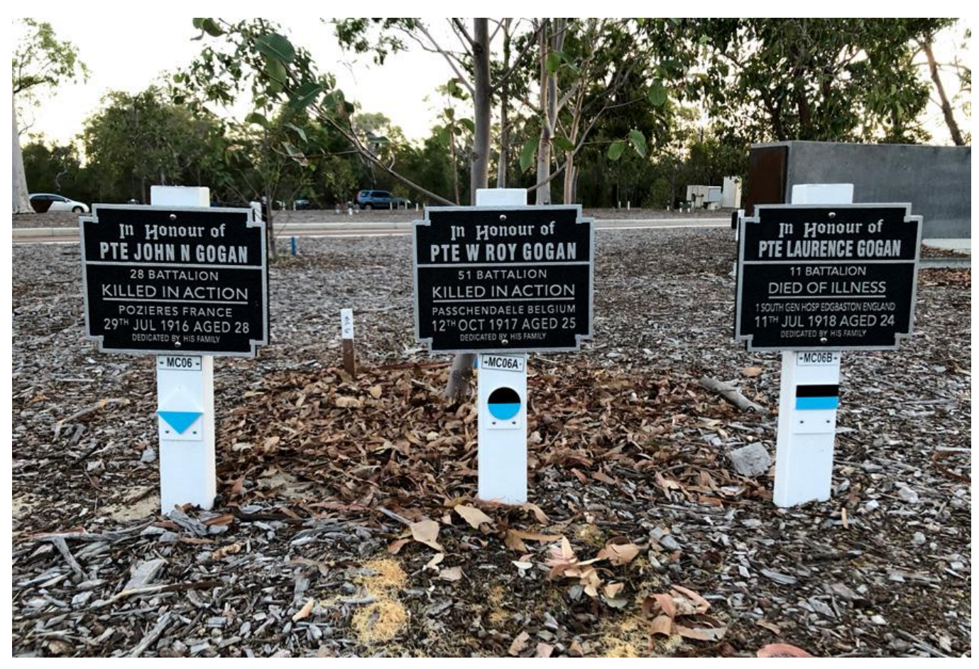
The Plaques were dedicated by the Family on 13th February, 2021