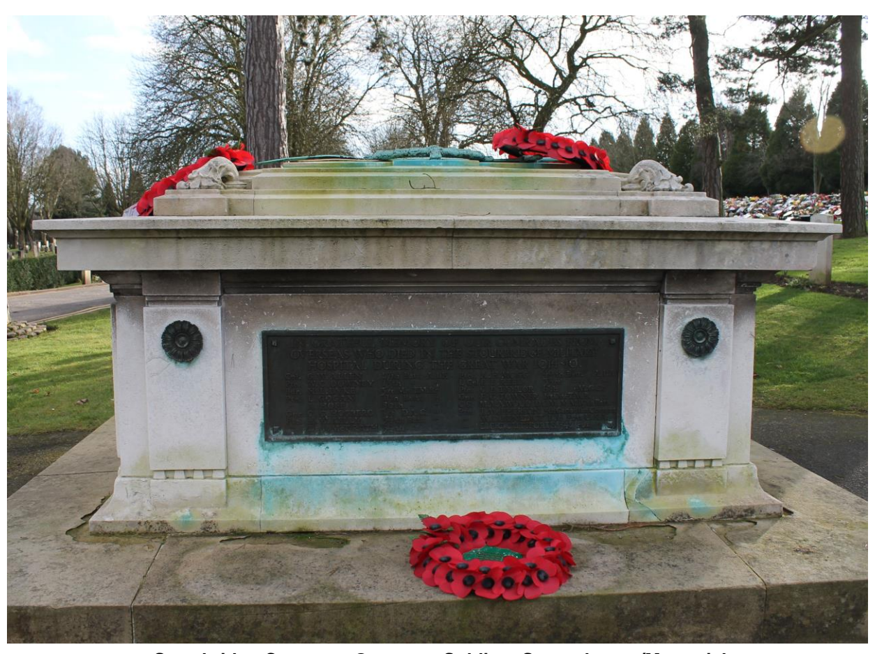
Stourbridge Cemetery Overseas Soldiers Sarcophagus/Memorial