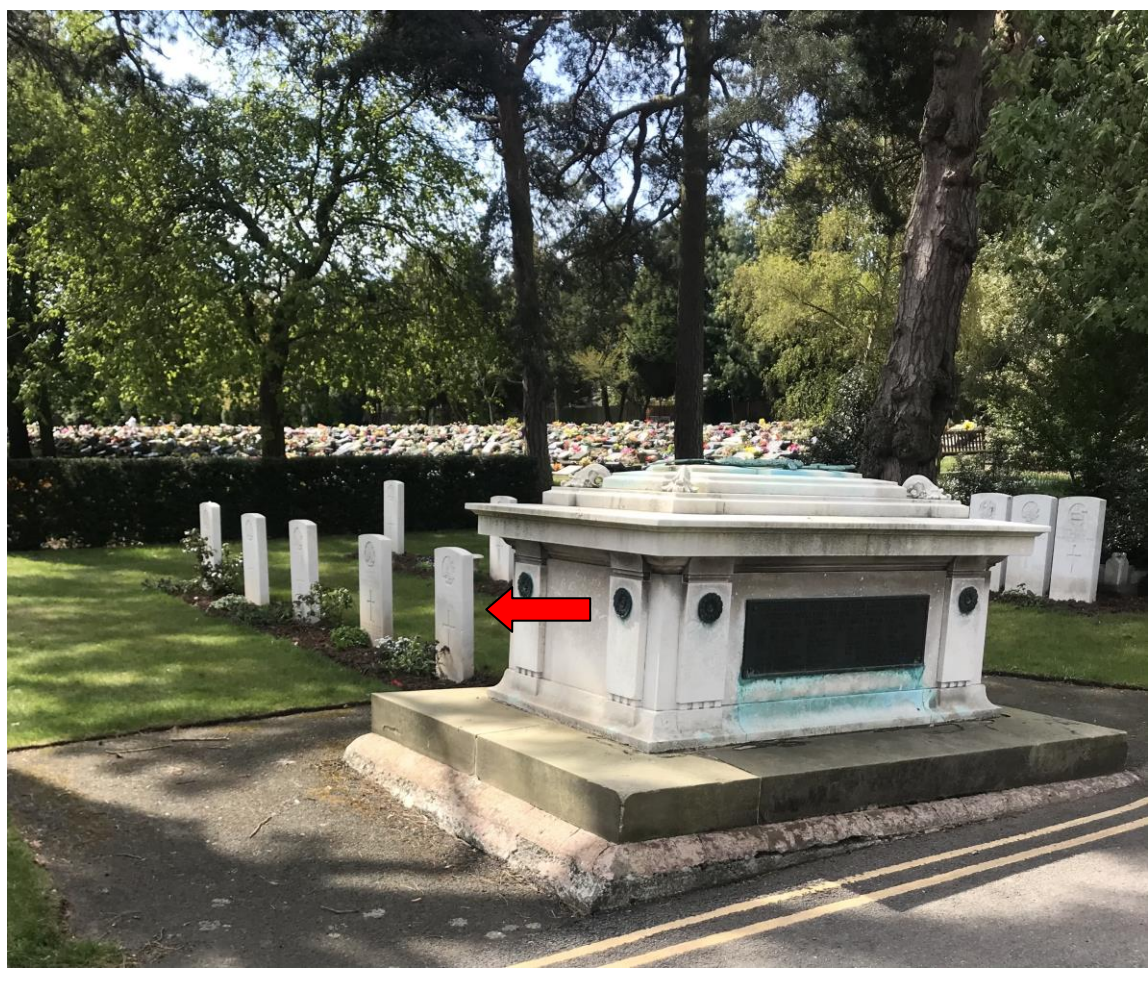
Arrow showing the Plot where Australian WW1 War Graves are located