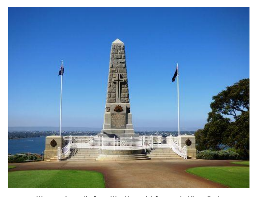
Western Australia State War Memorial Cenotaph, Kings Park

The heavy concrete foundations are supplemented by heavy brick walls which enclose an inner chamber or crypt. The walls surrounding the crypt are covered with The Roll of Honour; marble tablets which list under their units the names of more than 7,000 members of the services killed in action or as a result of World War One.