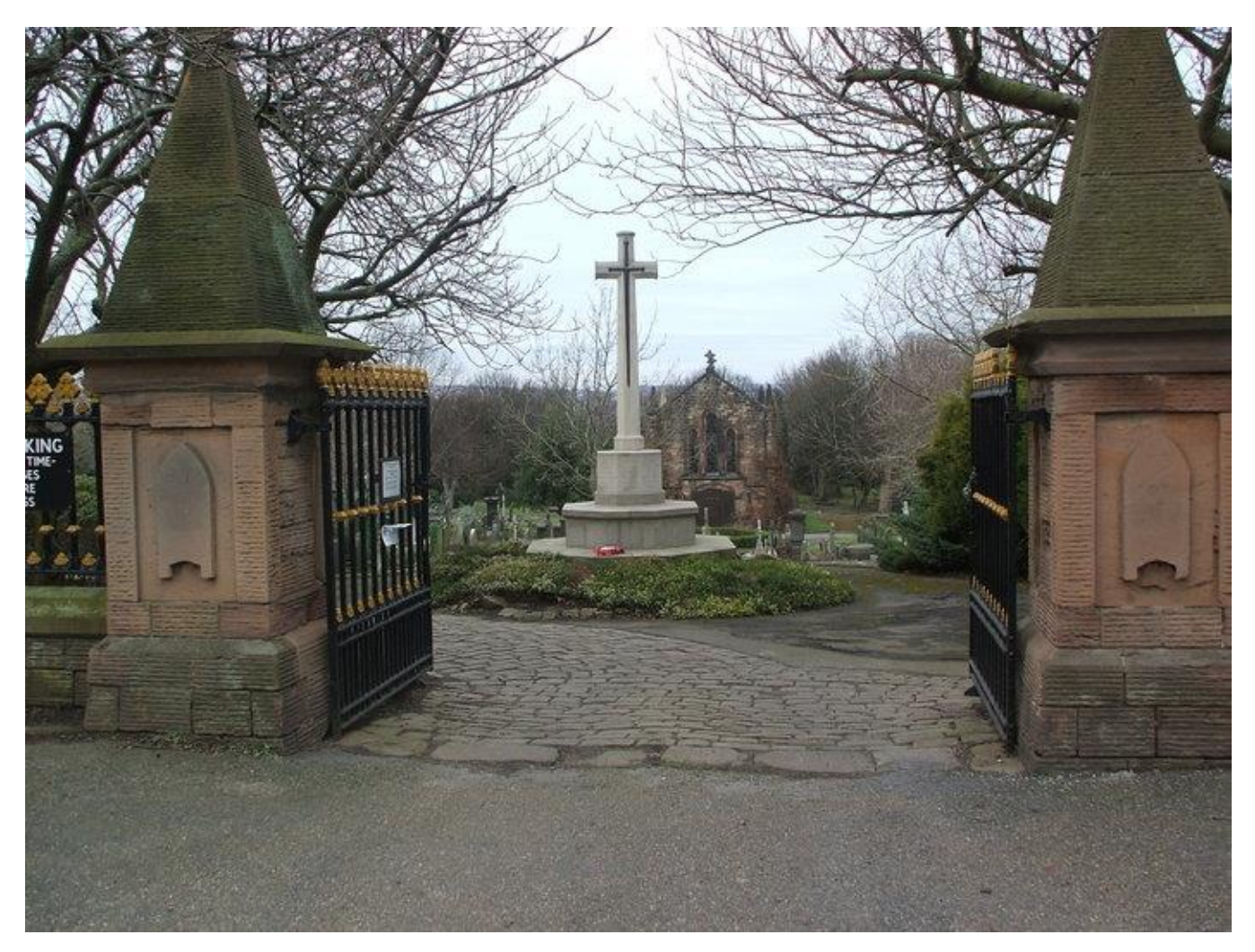
Entrance to Moorgate Cemetery, Rotherham, Yorkshire

Moorgate Cemetery, Rotherham, Yorkshire contains 52 Commonwealth burials of the First World War & 32 from the Second World War, all scattered throughout the cemetery. The Cross of Sacrifice is situated at the main entrance. (Information from CWGC)