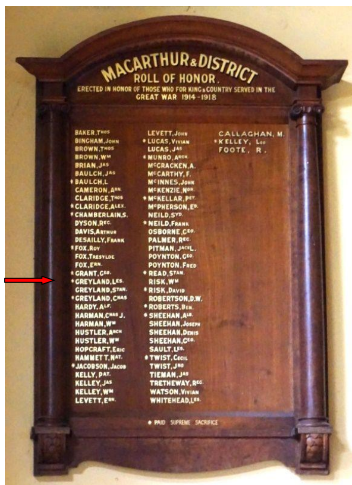
Macarthur & District Roll of Honour