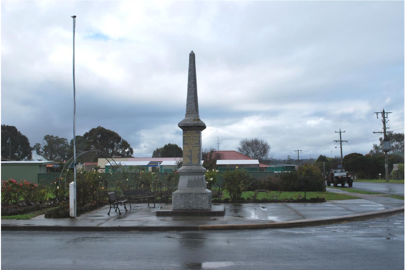
Macarthur War Memorial