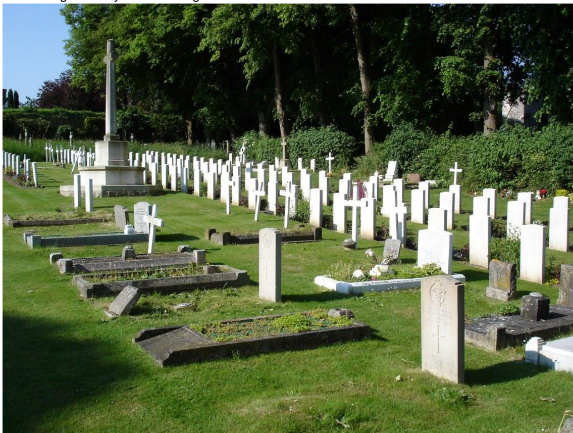
Christ Church Military Cemetery, Portsdown

Christ Church Military Cemetery, Portsdown contains 167 Commonwealth War Graves - 133 from World War 1, including 2 from Belgian Army & 34 relating to World War 2. There are 6 Australian World War 1 War Graves.