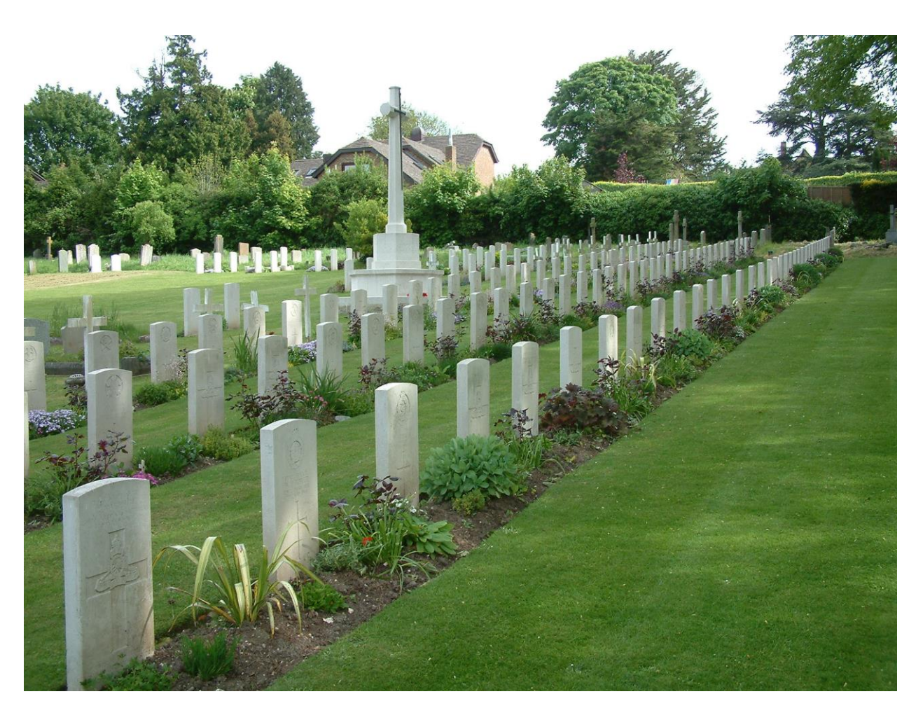
Christ Church Military Cemetery, Portsdown