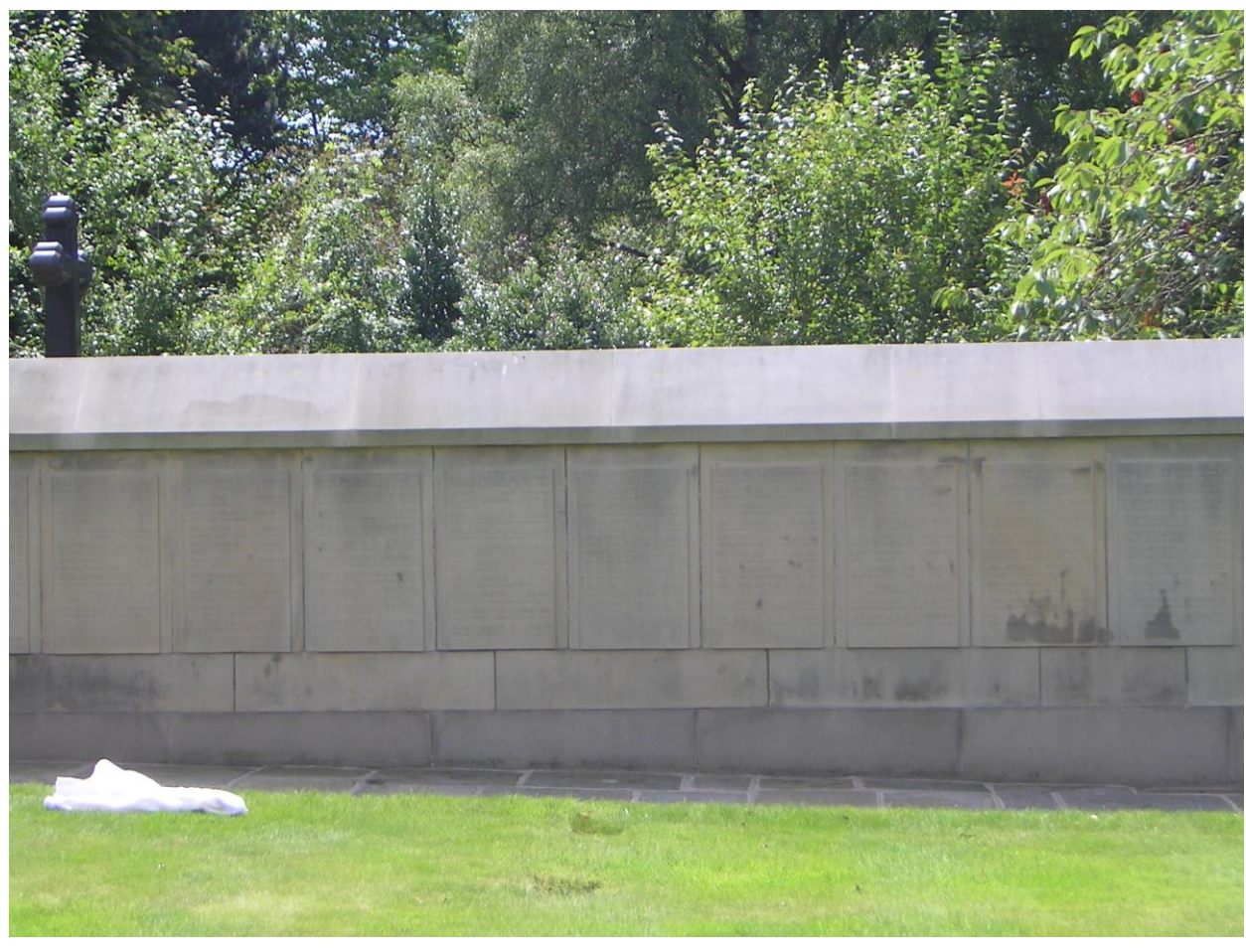
WW1 Screen Wall in Garden of Remembrance