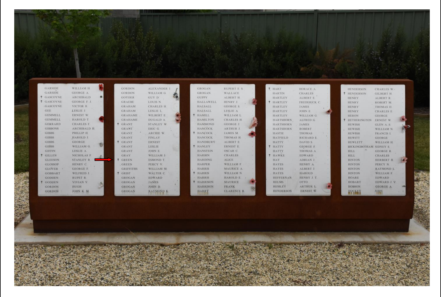
Telegraph Park Memorial