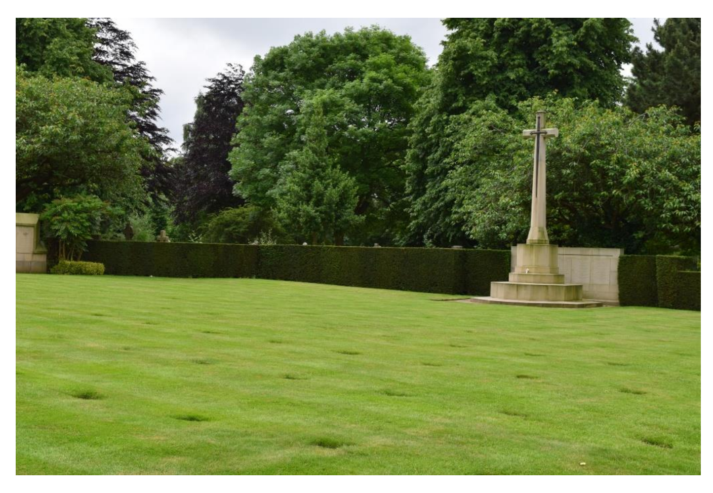
\textbf{Lodge Hill Cemetery, Birmingham} \ (\textit{Photos from CWGC})