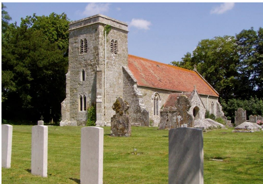
St. Edith's Churchyard, Baverstock, Wiltshire.