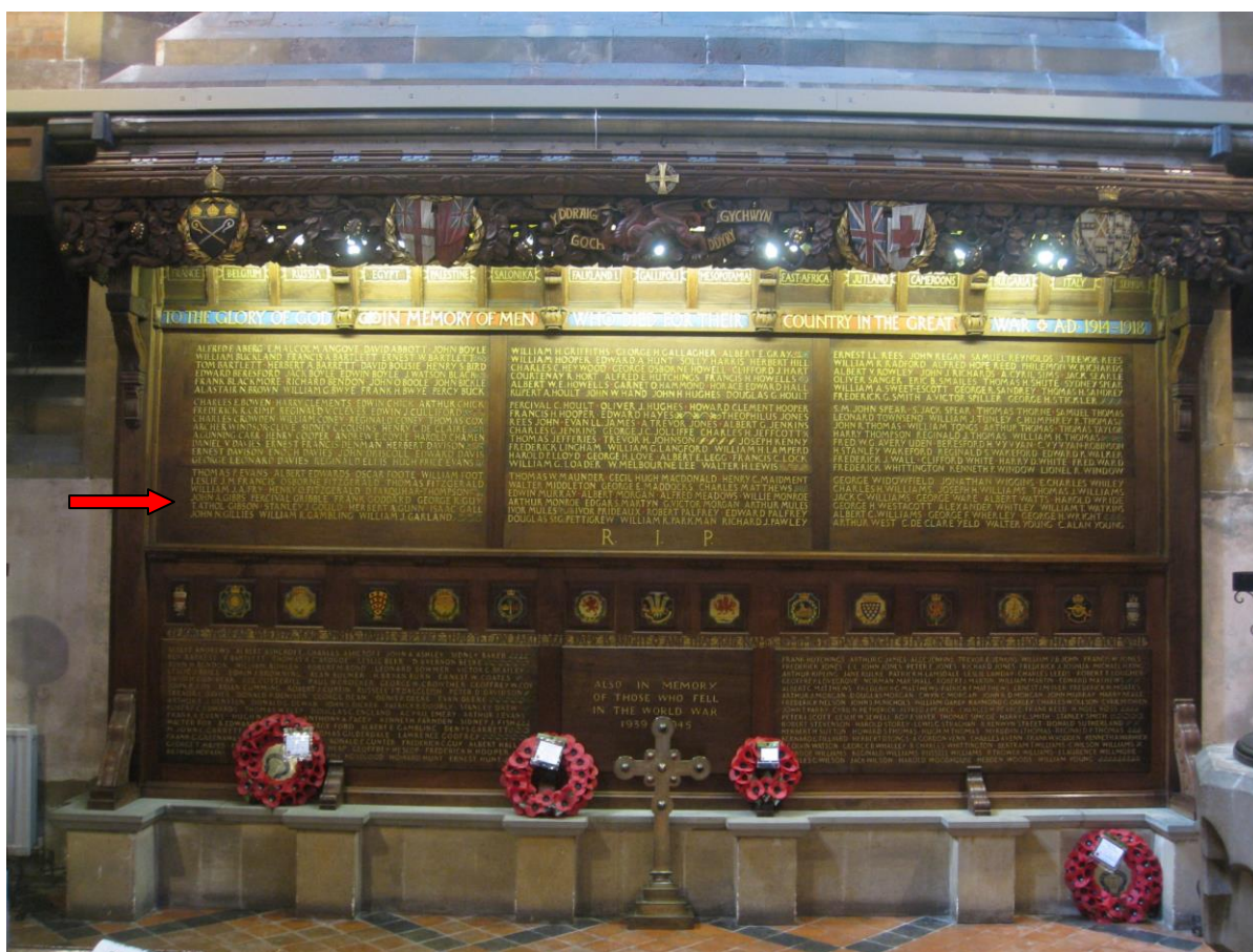
St. Augustine's Church, Penarth Roll of Honour (Photos from War Memorials Online- mhs)

(Left column, upper section, 3rd row from bottom)