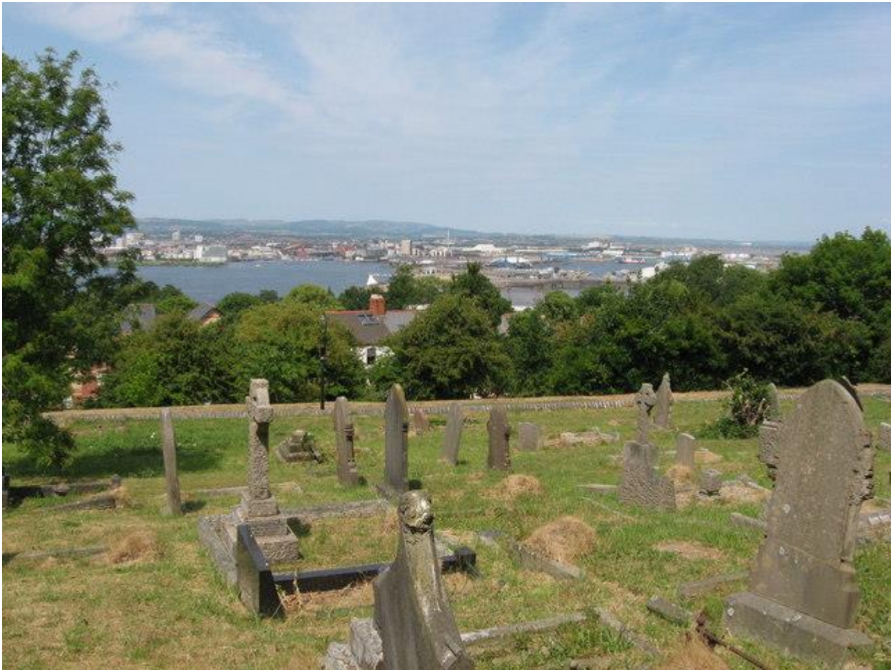
View from St. Augustine's