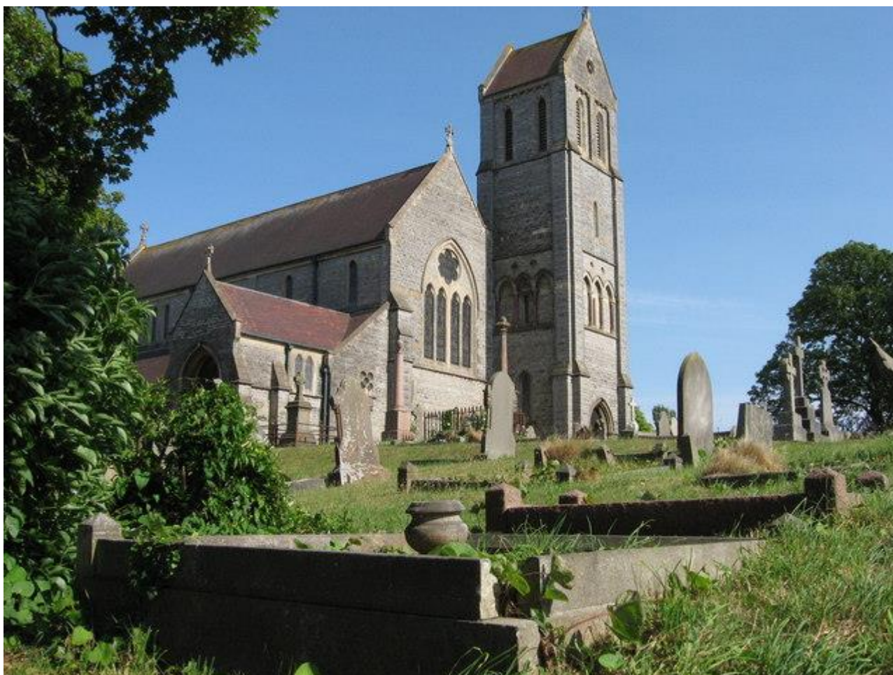
St. Augustine of Hippo Church, Penarth

St. Augustine of Hippo Churchyard, Penarth contains 14 Commonwealth War Graves – 10 relating to World War 1 & 4 relating to Word War 2.