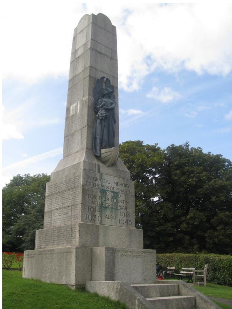
Penarth War Memorial