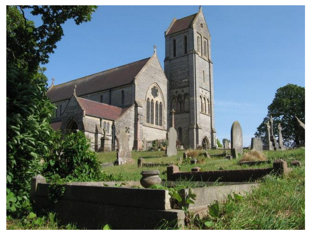
St. Augustine of Hippo Church, Penarth

St. Augustine of Hippo Churchyard, Penarth contains 14 Commonwealth War Graves – 10 relating to World War 1 & 4 relating to Word War 2.