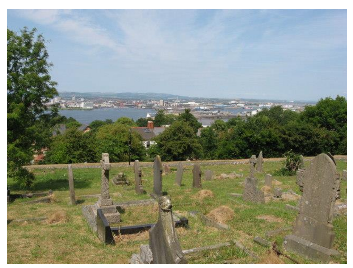
View from St. Augustine's