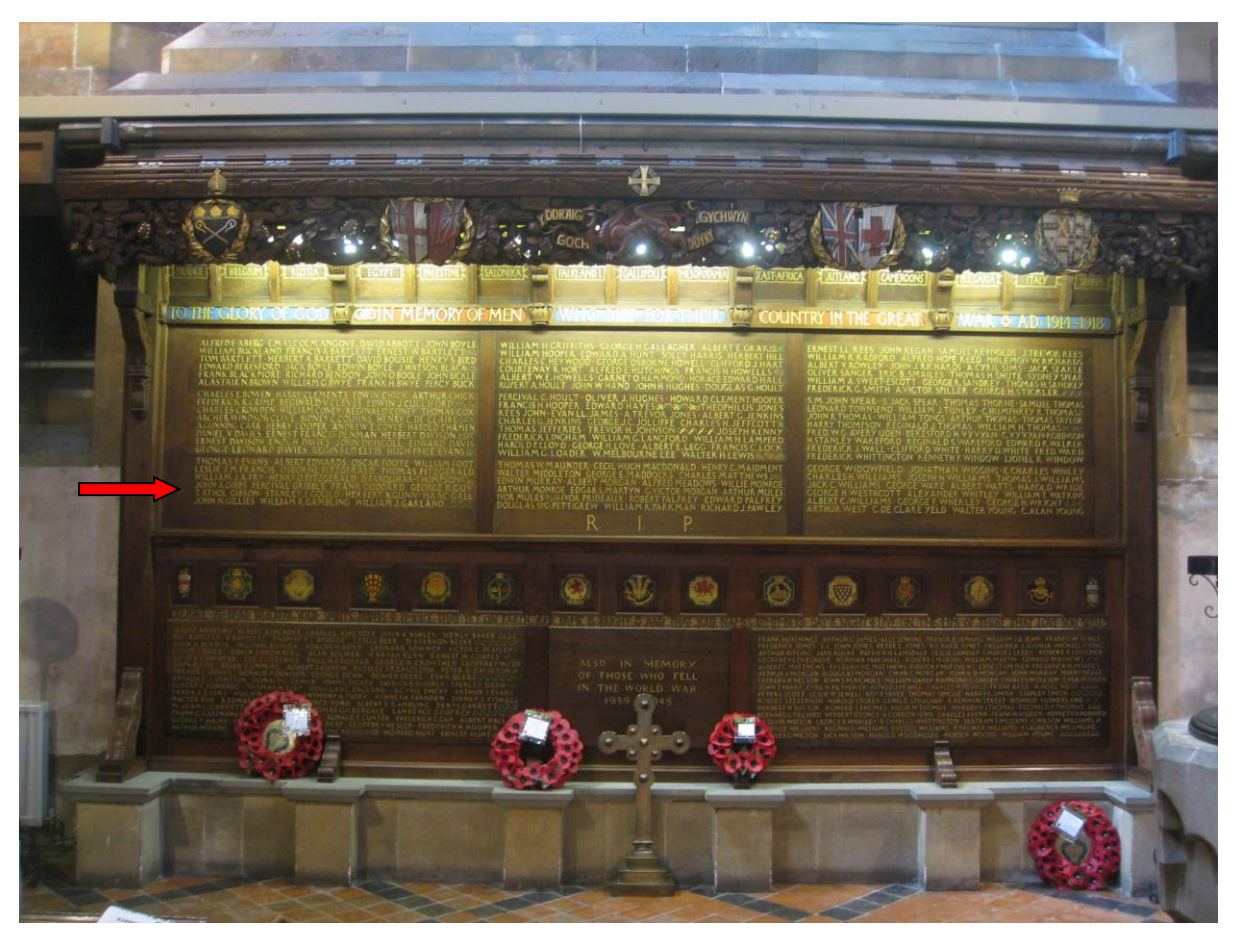
St. Augustine's Church, Penarth Roll of Honour