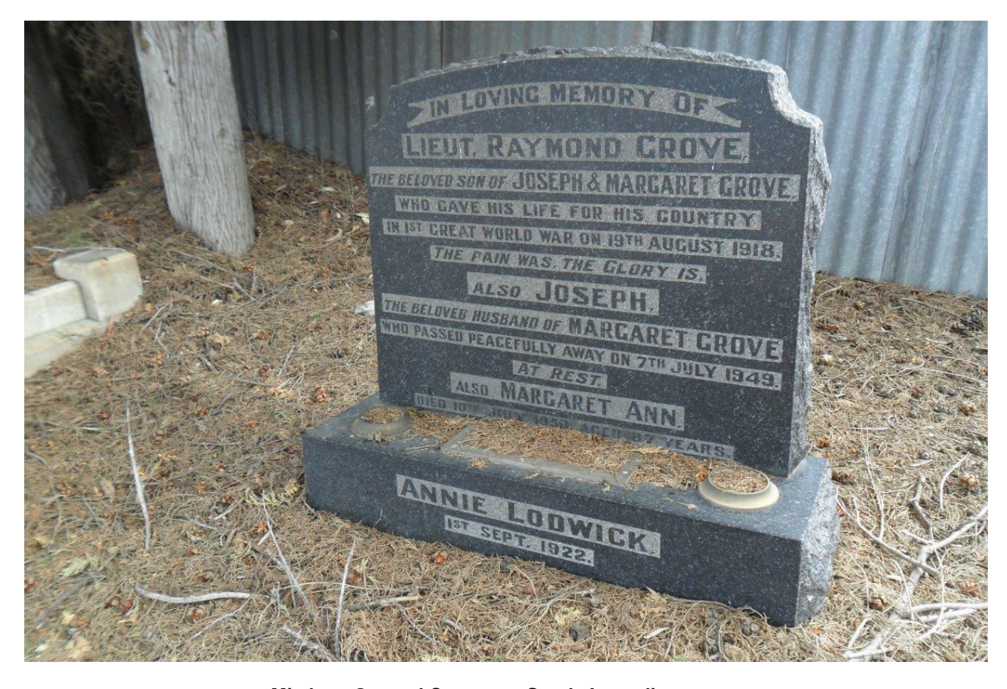
Grove Family Headstone in Mitcham General Cemetery, South Australia