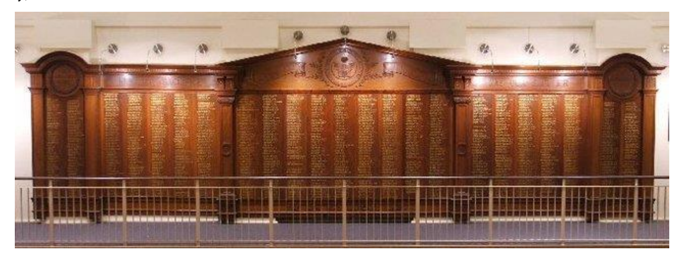
Unley City Honour Roll

R. H. Grove is remembered on the Unley City Honour Roll, located in the Town Hall, Unley Road & Oxford Terrace, Unley, South Australia.