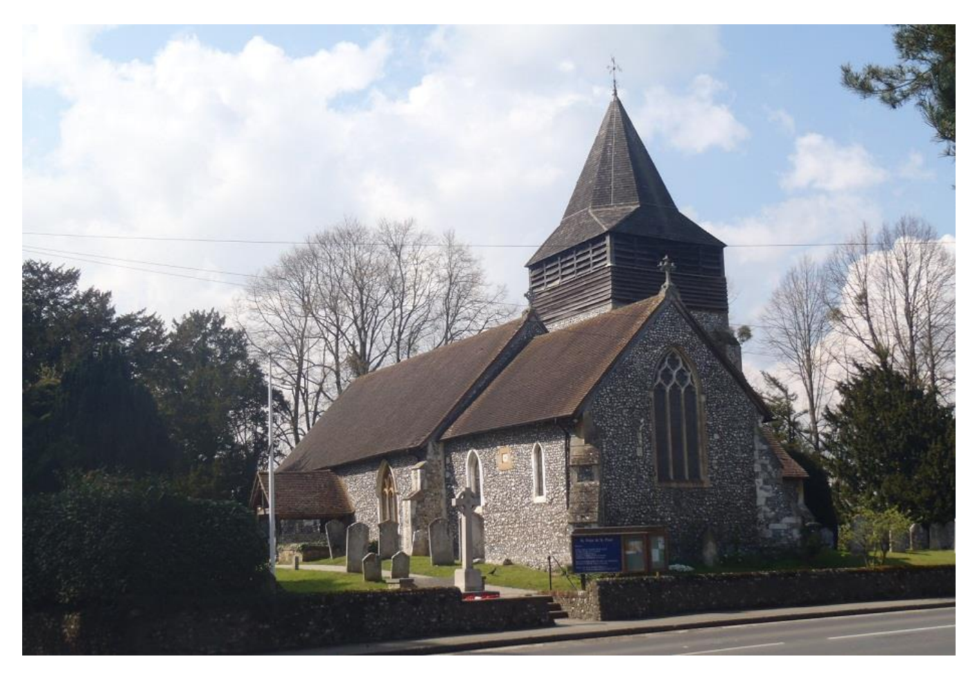
St. Peter & St. Paul Church, West Clandon, Surrey

St. Peter & St. Paul Church Cemetery, West Clandon contains 11 Commonwealth War Graves – 10 from World War 1 & 1 from World War 2.