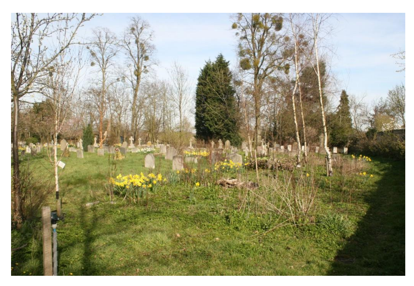
St. Peter & St. Paul Church Cemetery, West Clandon, Surrey