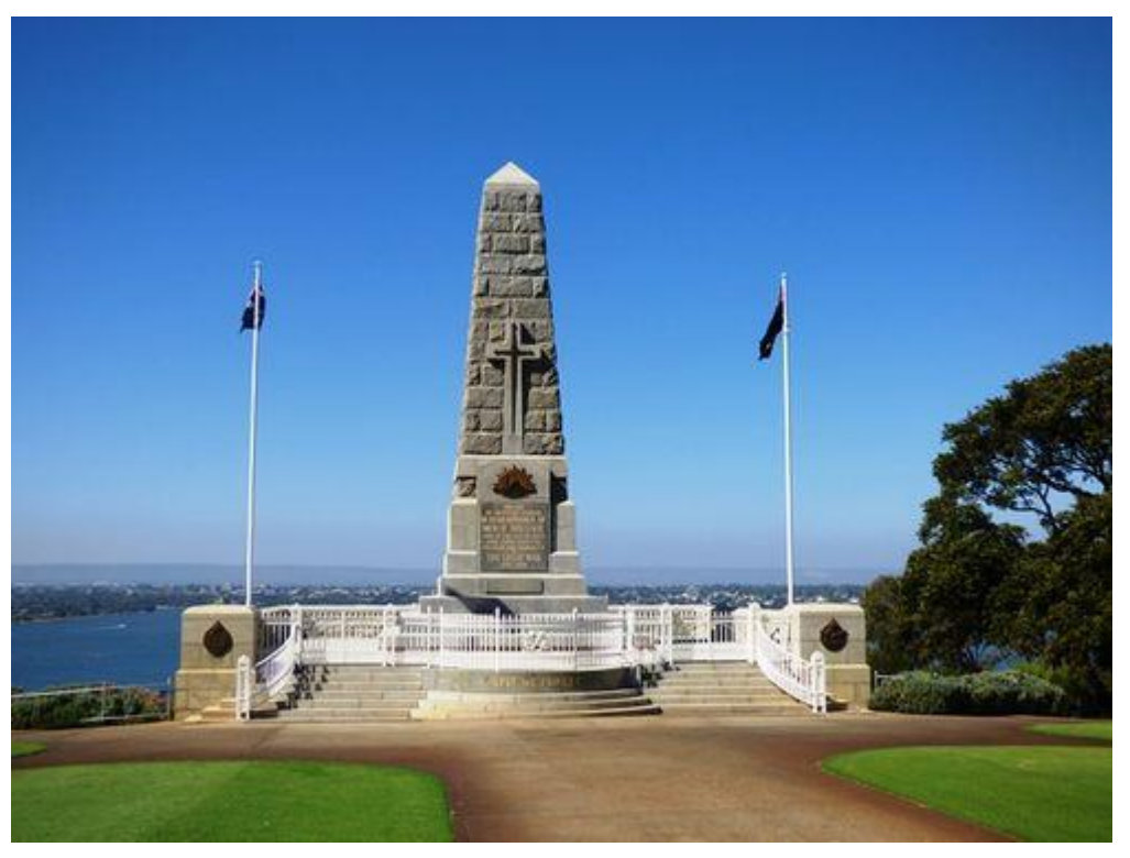
Western Australia State War Memorial Cenotaph, Kings Park (above) & (below) The Crypt with the Roll of Honour names

The heavy concrete foundations are supplemented by heavy brick walls which enclose an inner chamber or crypt. The walls surrounding the crypt are covered with The Roll of Honour; marble tablets which list under their units the names of more than 7,000 members of the services killed in action or as a result of World War One.