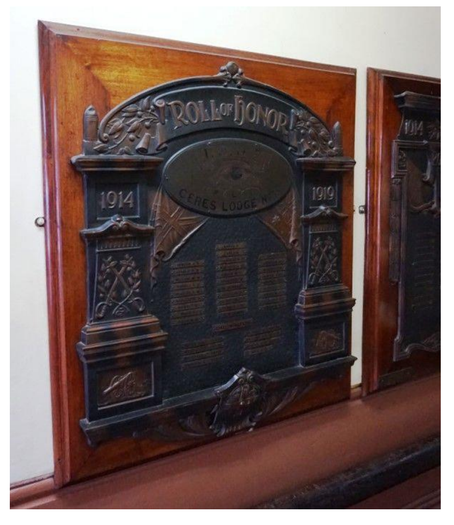
Ceres Lodge No 35 Roll of Honour

F. H. Halliday is also remembered on the Ceres Lodge No 35 Roll of Honour, located in the Port Pirie National Trust Museum, 73 Ellen Street, Port Pirie, South Australia.