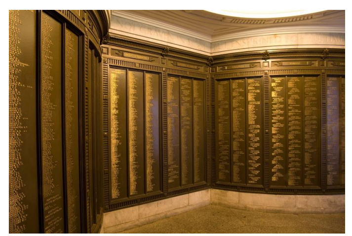
National War Memorial – Adelaide