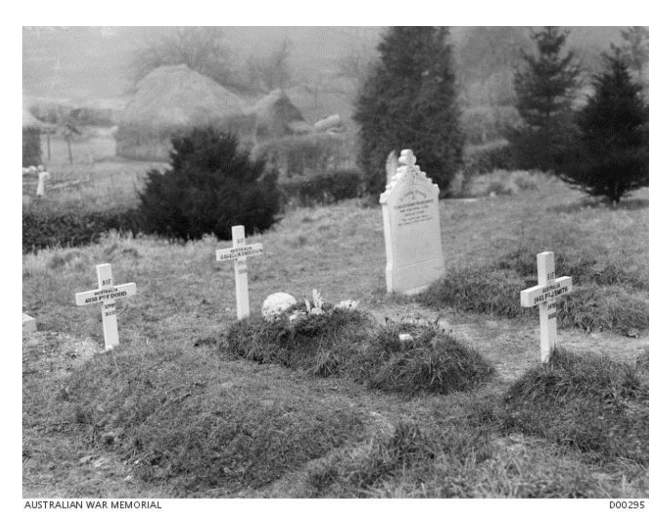
Original Grave Markers - Barford St. Martin Church Cemetery

Graves of Australian soldiers in the cemetery at Barford St. Martin's.