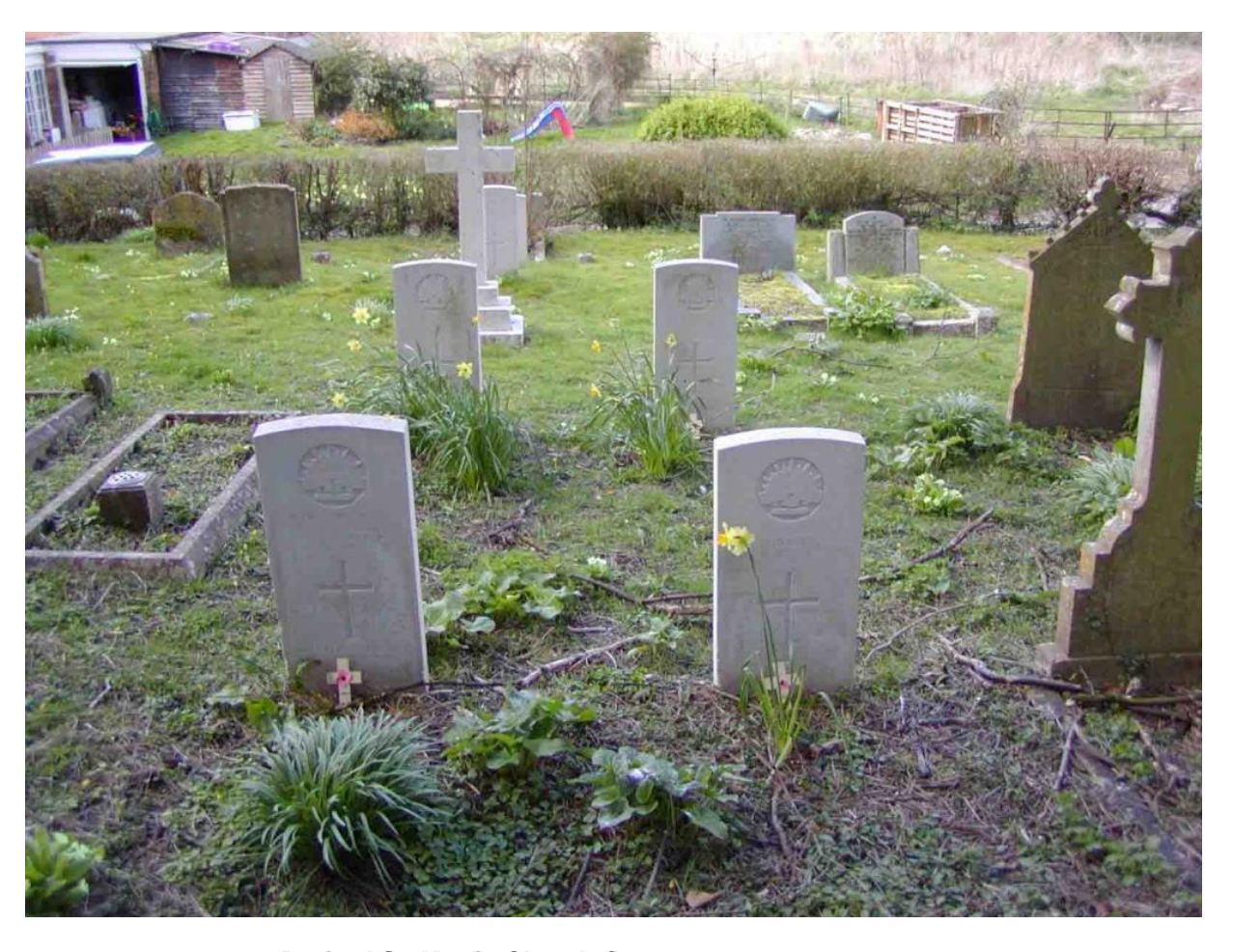
Barford St. Martin Church Cemetery