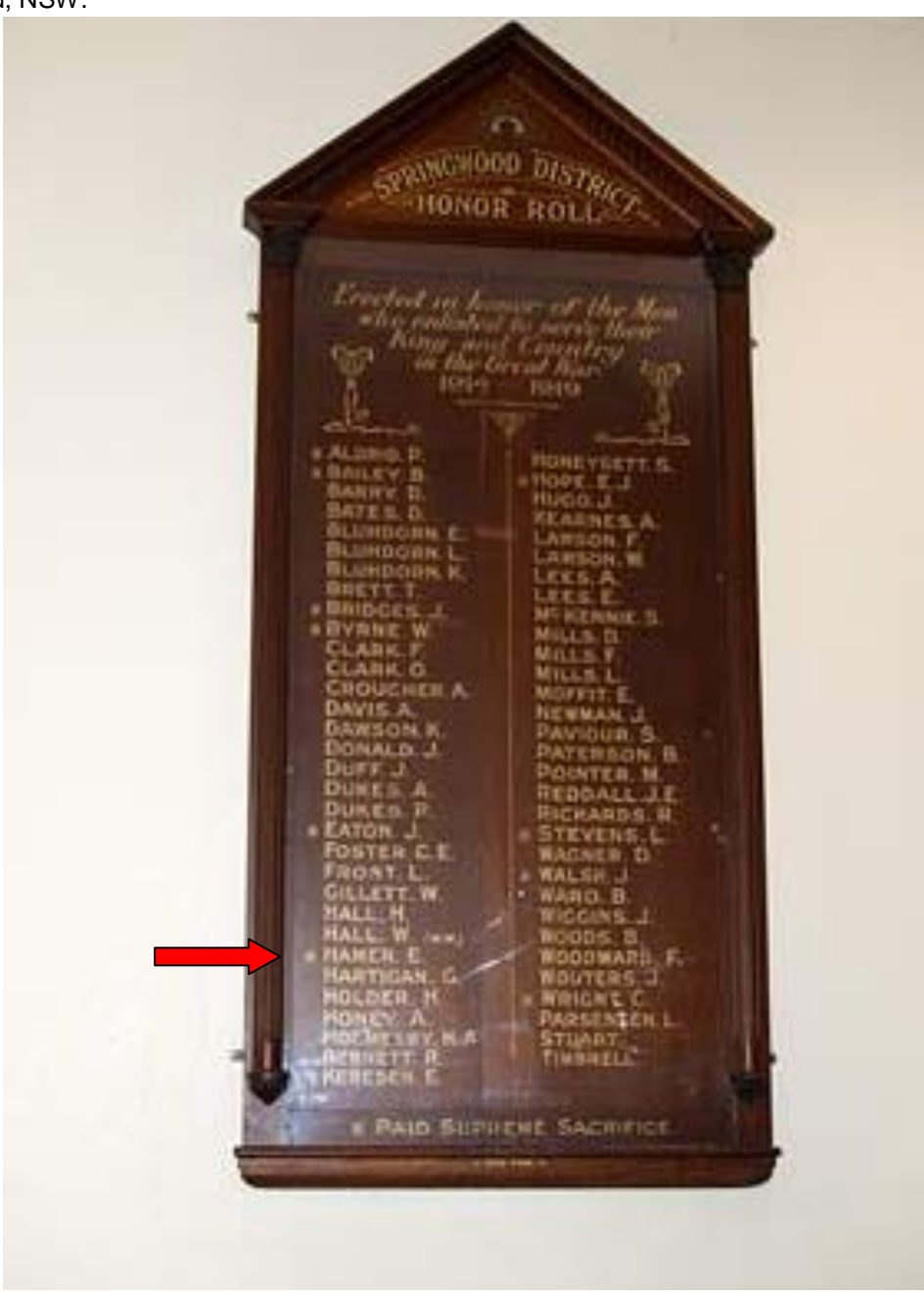
Springwood District Honor Roll