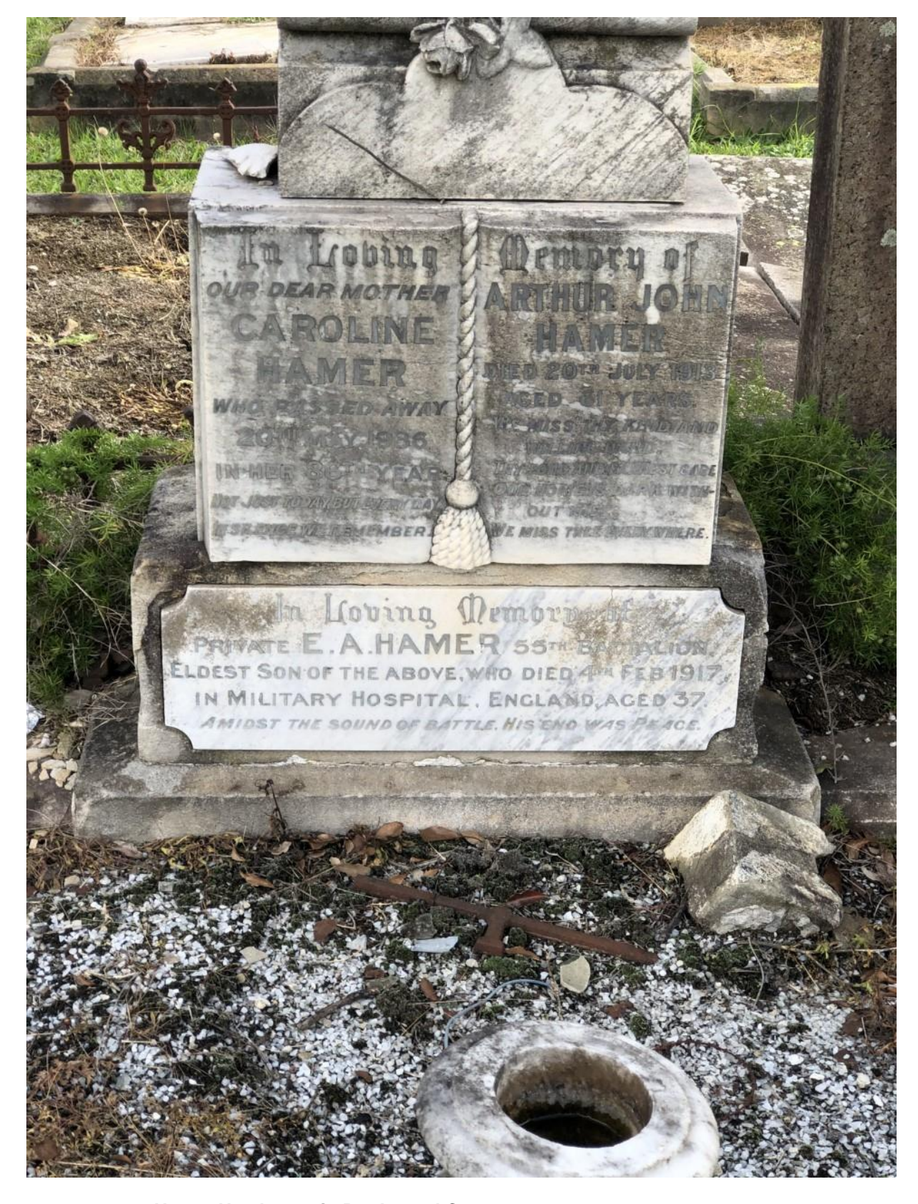
Hamer Headstone in Rookwood Cemetery