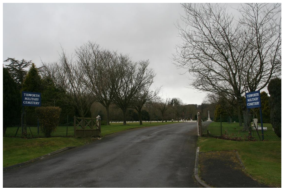
Tidworth Military Cemetery

The cemetery also contains 40 war graves of other nationalities, many of them Polish. (Information from CWGC)