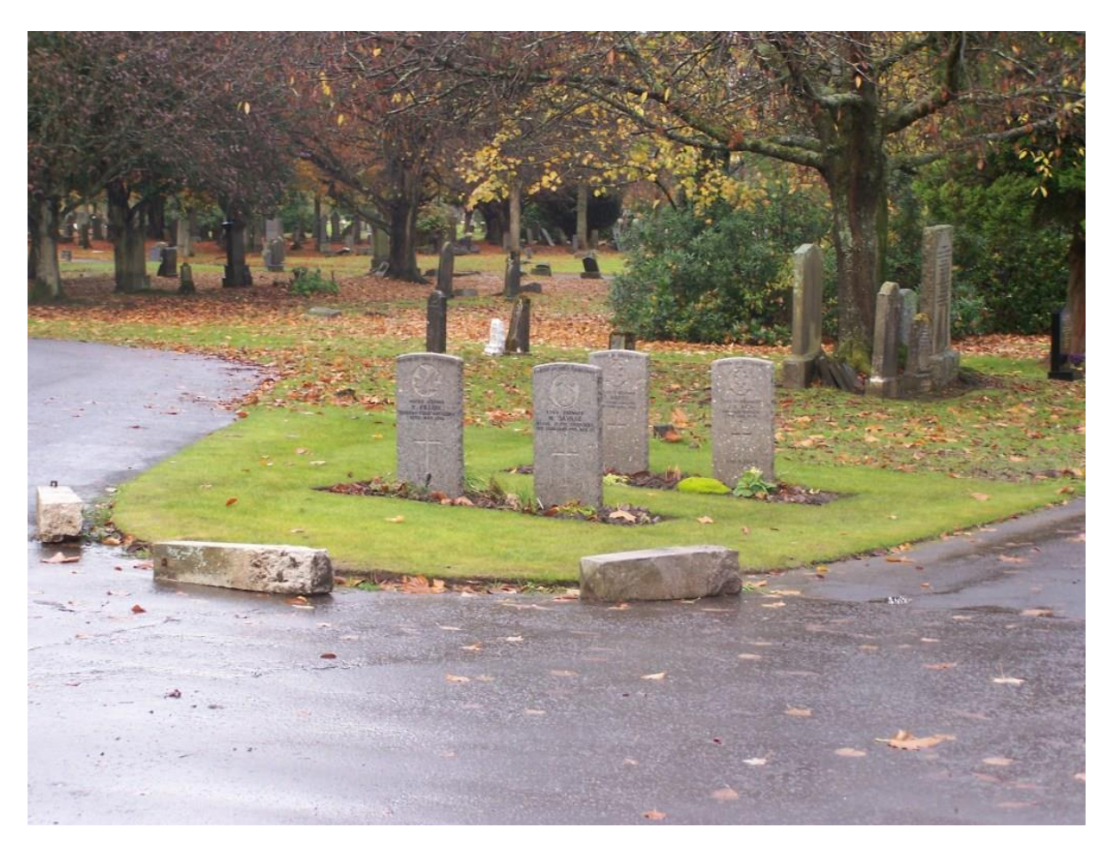
Some CWGC Headstones in Lambhill Cemetery, Glasgow