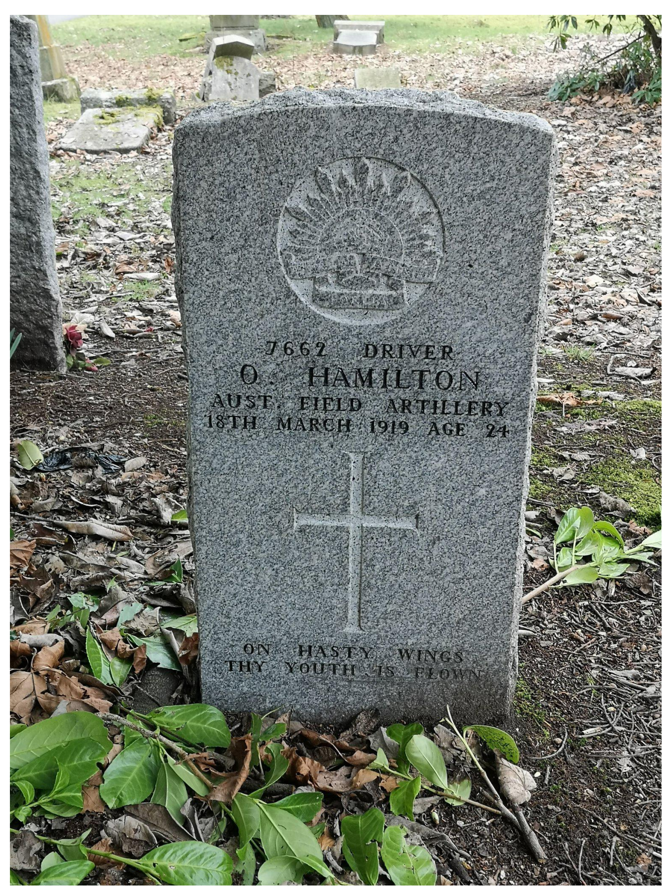
Photo of Driver O. Hamilton's Commonwealth War Graves Commission Headstone in Lambhill Cemetery, Glasgow, Scotland.