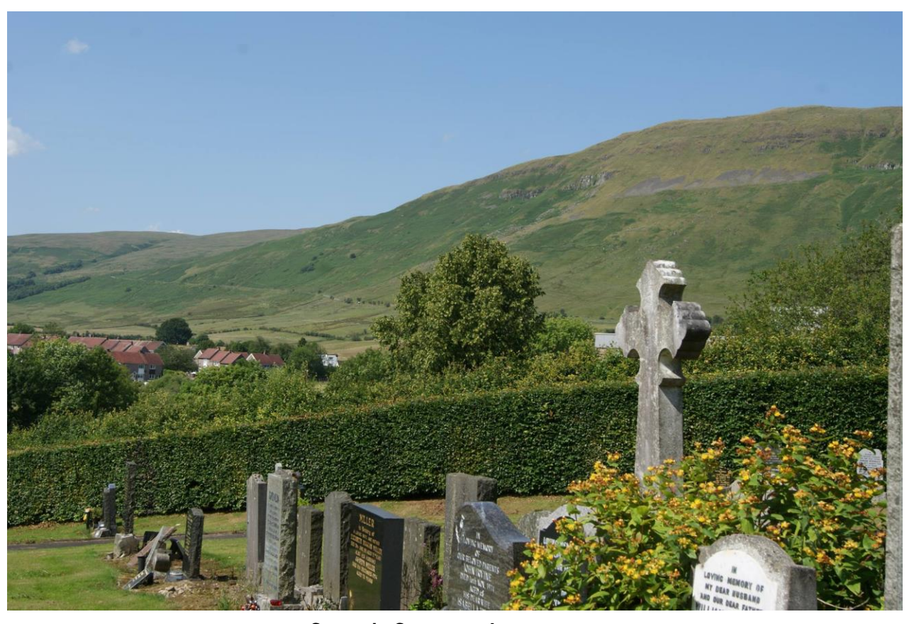
Campsie Cemetery, Lennoxtown

Campsie Cemetery, Lennoxtown, also known as Lennoxtown Cemetery, contains 15 Commonwealth War Graves – 9 from World War 1 & 6 from World War 2.