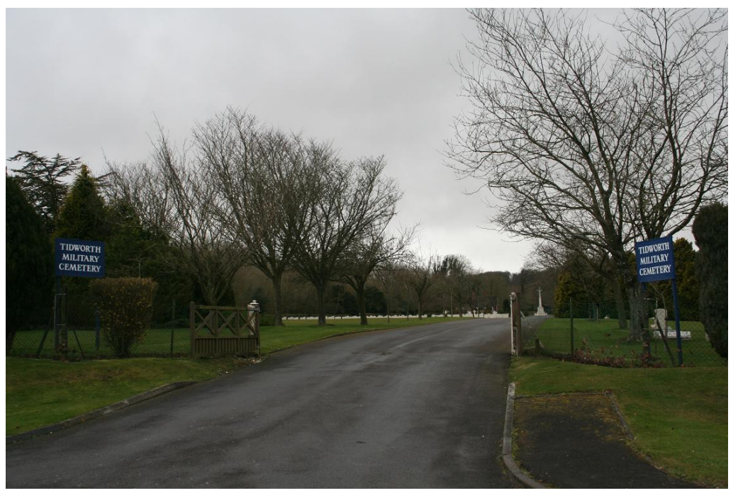
Tidworth Military Cemetery

The cemetery also contains 40 war graves of other nationalities, many of them Polish. (Information from CWGC)