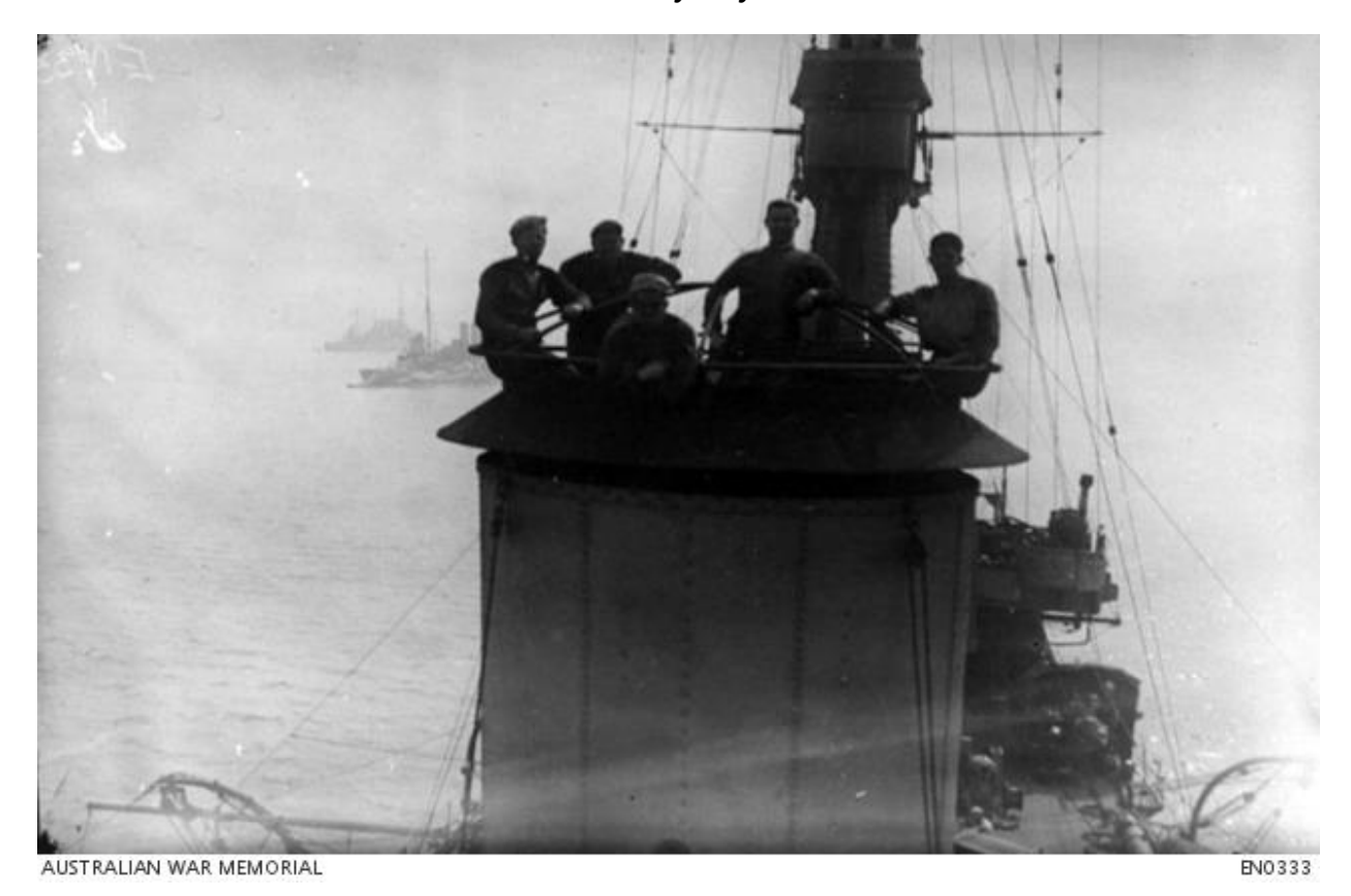
October, 1918 - Group portrait of five unidentified stokers aboard HMAS Sydney. They are cleaning one of the funnels. HMAS Sydney was at the southern naval base of the Royal Navy's Grand Fleet, near the Forth of Firth, Scotland, during a break from patrols of the North Sea with the 2nd Light Cruiser Squadron.