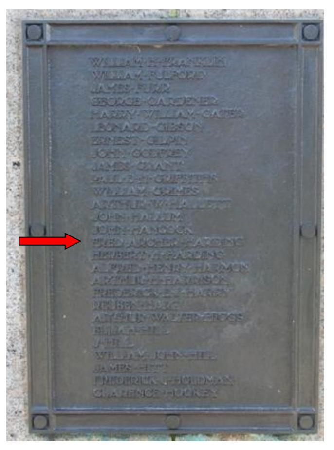
An example of the plaques with the names of the soldiers buried in the World Ward 1 plot.