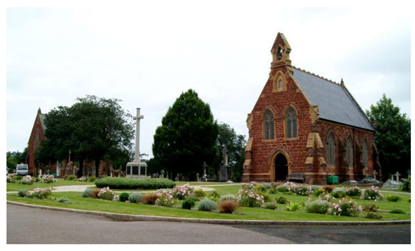
The World War 1 plots near the Memorial with plants & flowers between the named granite grave markers