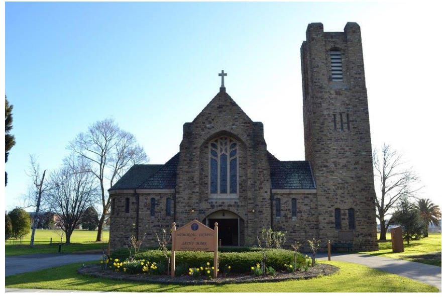
HMAS Cerberus Protestant Chapel of St Mark, Crib Point, Victoria