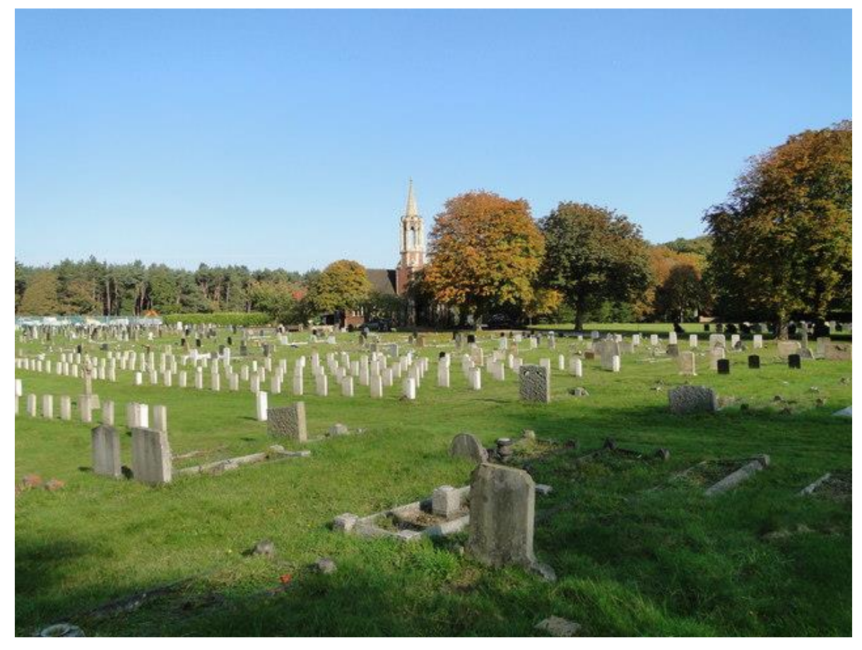
Cromer No. 2 Burial Ground, Norfolk