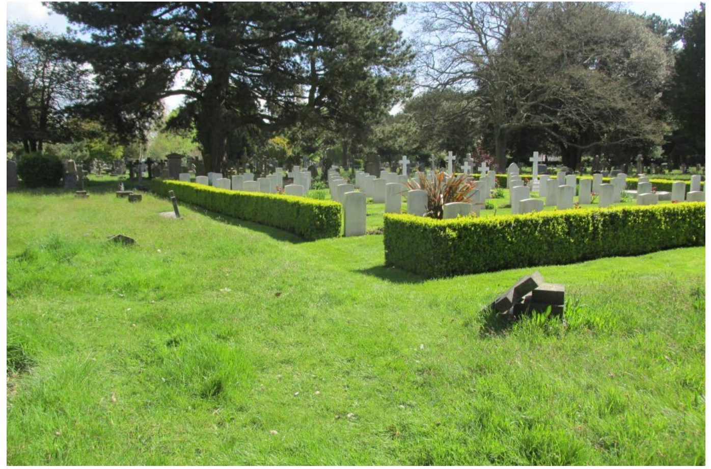
Bournemouth East Cemetery